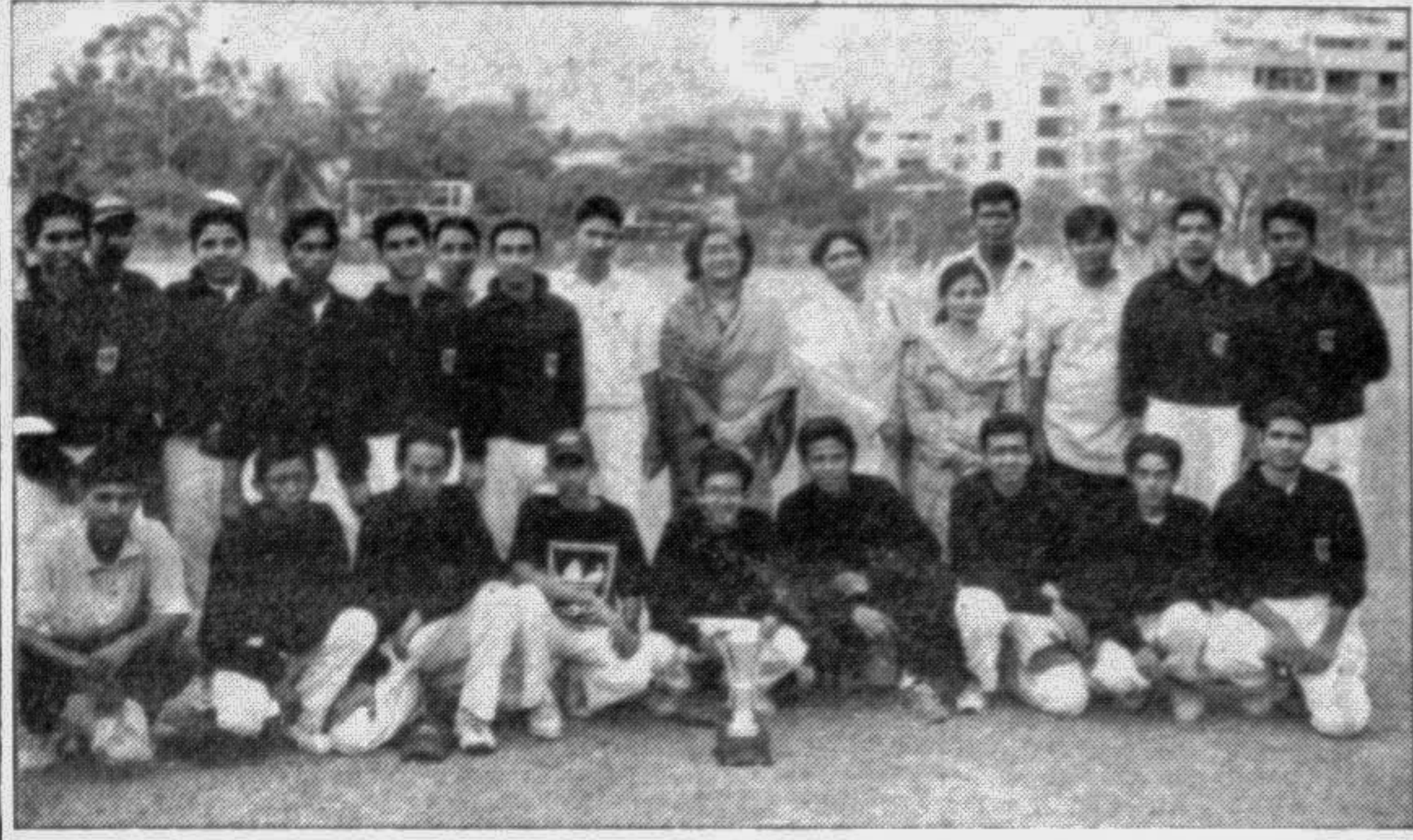
Players and officials of the Scholastica team, which clinched the Nirman cricket trophy beating Narayanjan High School in the final at the Dhanmondi Cricket Stadium on Mar 26.

The foreign teams are: Central Swimming Club of Calcutta, Calcutta University Institute and Sri Lanka.