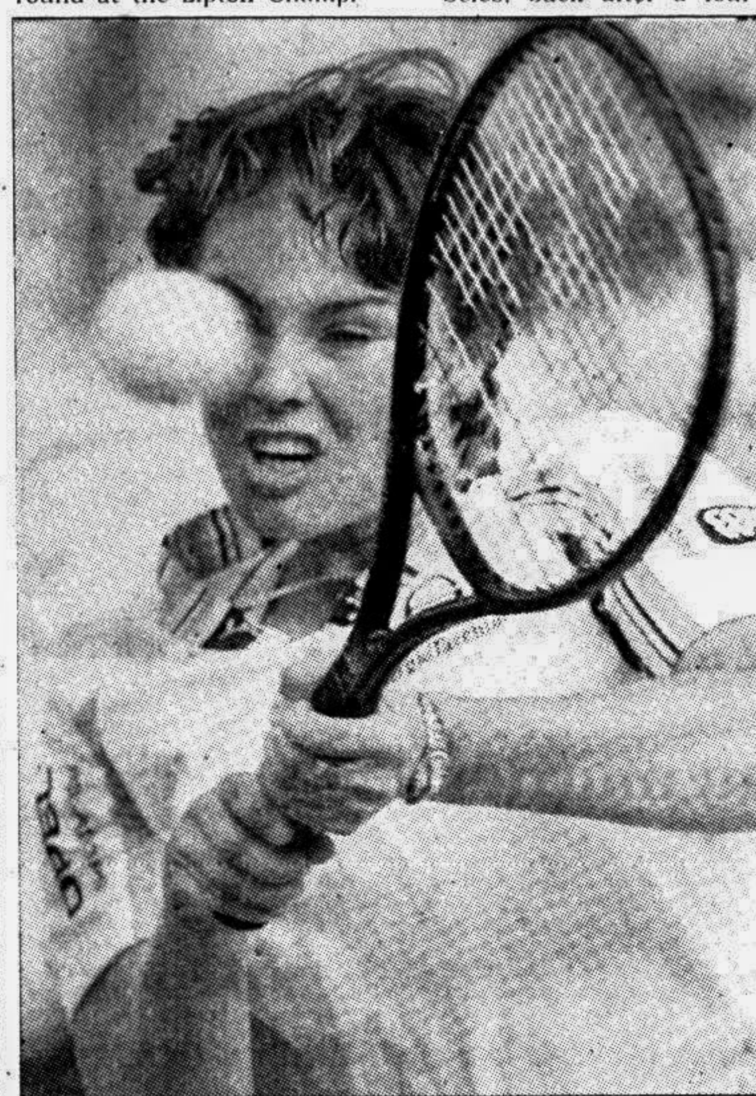
Martina Hingis of Switzerland makes a backhand return against American Venus Williams at the Lipton Championships in Key Biscayne on Mar 23. Hingis won 6-4, 6-2.