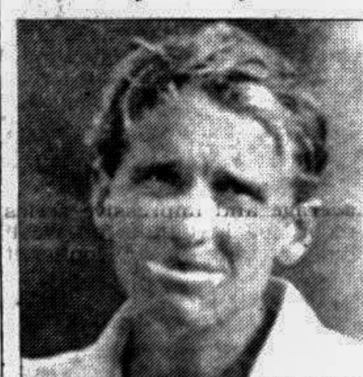
DONALD... 5 for 36 their second innings and saw South Africa firmly in control by stumps on the third day. Australia, already faced

with a first innings deficit of 157 runs, had no answer to Donald — and fellow strike bowler Brett Schultz — in full cry.