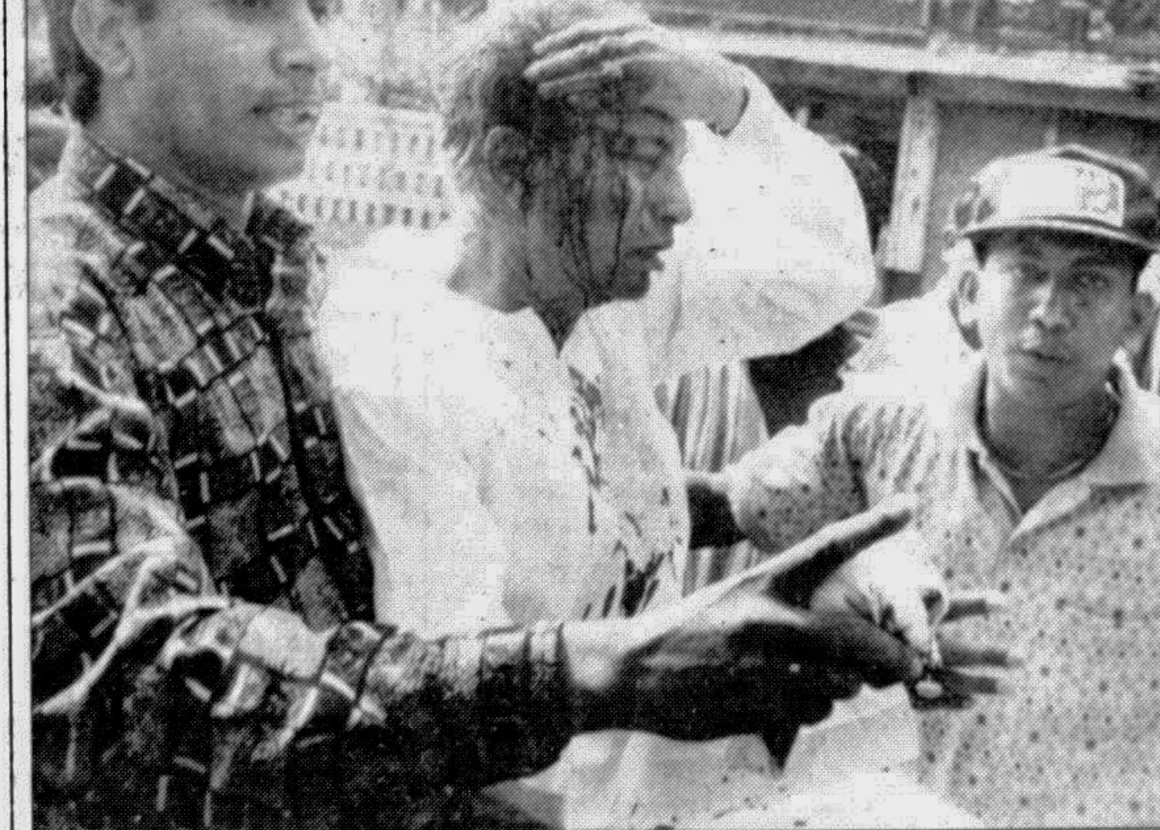
BNP activists helping their leader former home minister Abdul Matin Chowdhury who was injured while leading a procession in the city during hartal hours yesterday.