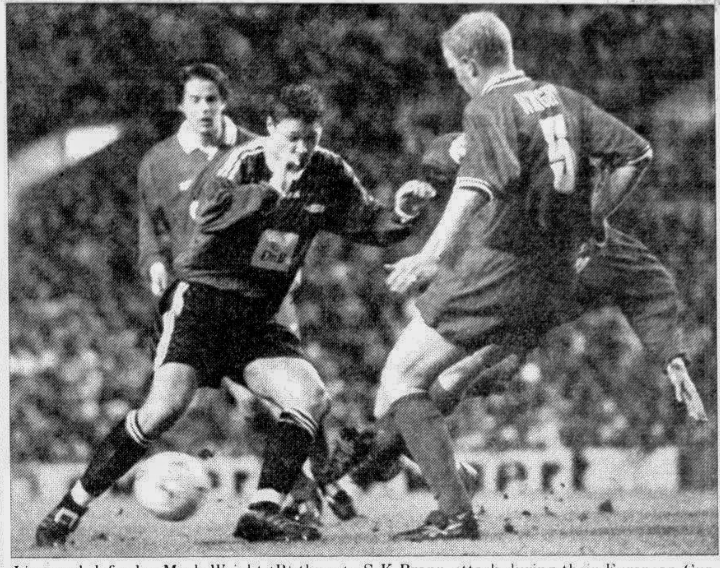
Liverpool defender Mark Wright (R) thwarts S K Brann attack during their European Cup Winners' Cup quarterfinal second leg clash in Liverpool on Mar 20. The hosts defeated the Norwegian side 3-0.

SOUTH AFRICA: Gary Kirsten, Adam Bacher, Brian McMillan, Daryll Cullinan, Hansie Cronje (captain), Jacques Kallis, Lance Klusener, Dave Richardson, Allan Donald, Brett Schultz, Pat Symcox. Twelfth man: Herschelle Gibbs.