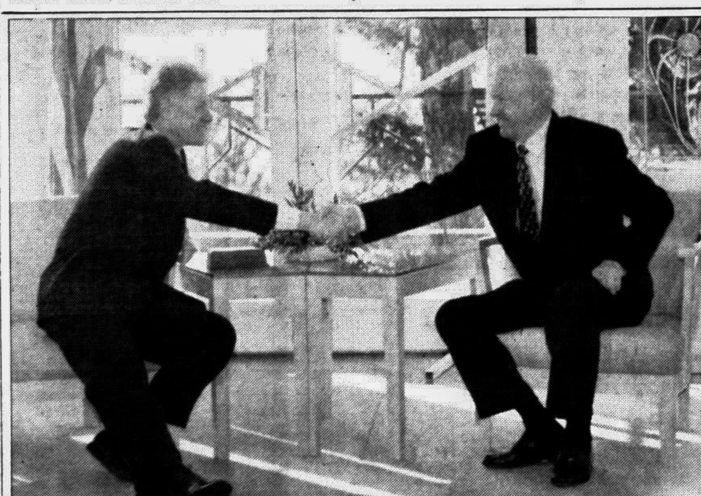
US President Bill Clinton (L) shakes hands with his Russian counterpart Boris Yeltsin before their bilateral meeting at the Finnish Presidential Residence yesterday in Helsinki. Bill Clinton and Boris Yeltsin will face tough talks over the issue on how to accommodate a once-mighty and still proud Russia within a new Europe.

refuted the government's allegation that her BNP government did not produce a single kilowatt of electricity. She said the BNP government had produced 2150 megawatt of electricity in March 1996 but in March this year, power generation has been reduced to 1600 megawatt. "Why, in one year, power generation has been reduced by 500 megawatt," she posed the question. This is only because of the mismanagement and inefficiency of the present government. The Leader of the Opposition alleged that the government See Page 12 Col 1