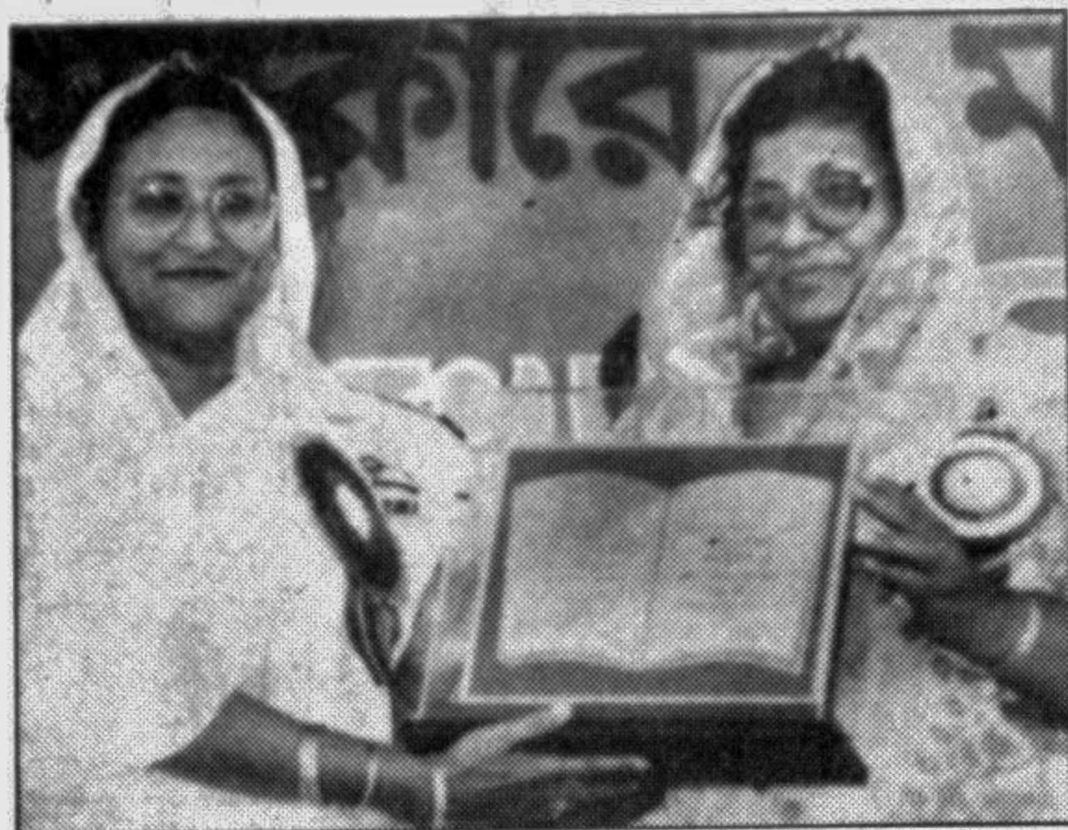
Prime Minister Sheikh Hasina being presented with a crest by Forest and Environment Minister Sayeda Sajeda Chowdhury at a reception accorded her by Mohila Mukti-juddha Sangsad in the city yesterday in honour of the PM's receiving an honorary 'Doctor of Law' degree from Boston University, USA, recently.