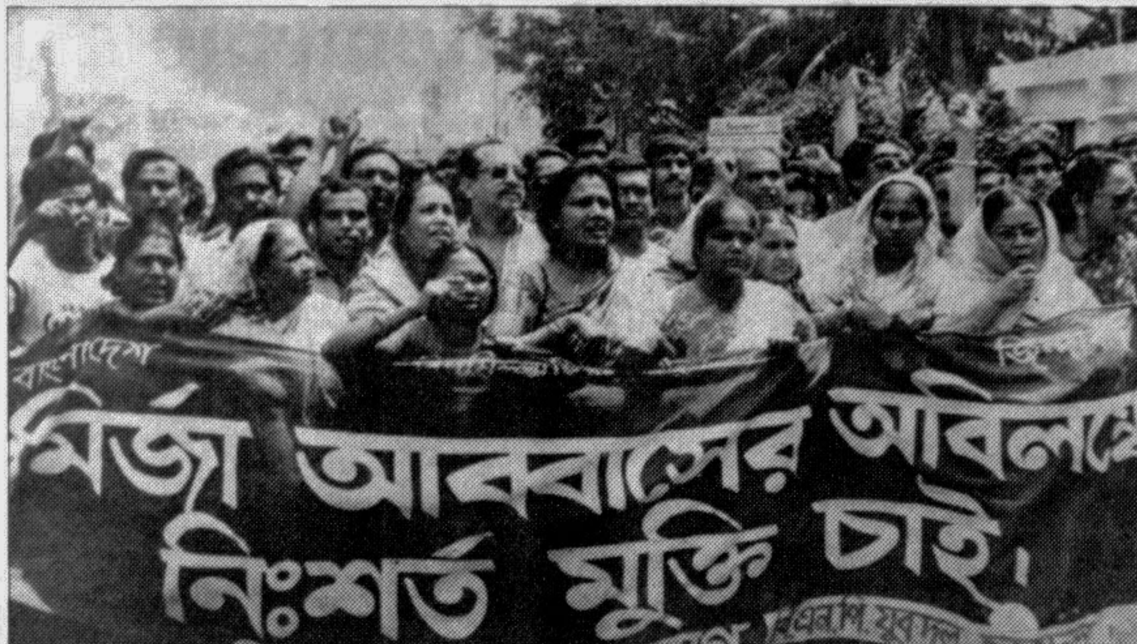
Jubo Dal activists brought out a procession protesting the arrest of its president, Mirza Abbas, in the city yesterday.

But the government has taken the initiative to formulate an education policy on the basis of Kudrat-E-Khuda Commission Report, the leaders added.