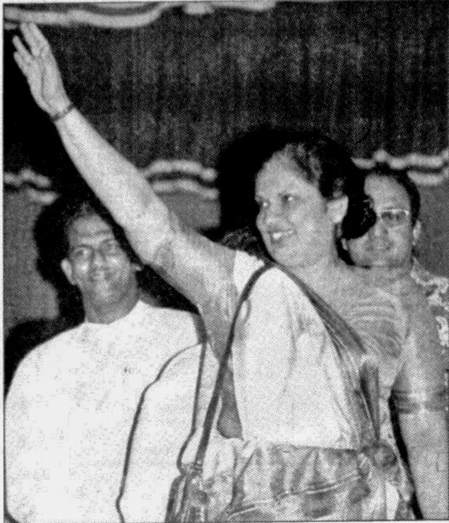
Sri Lankan President Chandrika Kumaratunga waves after the closing of local council election campaigning in the capital Colombo Tuesday.