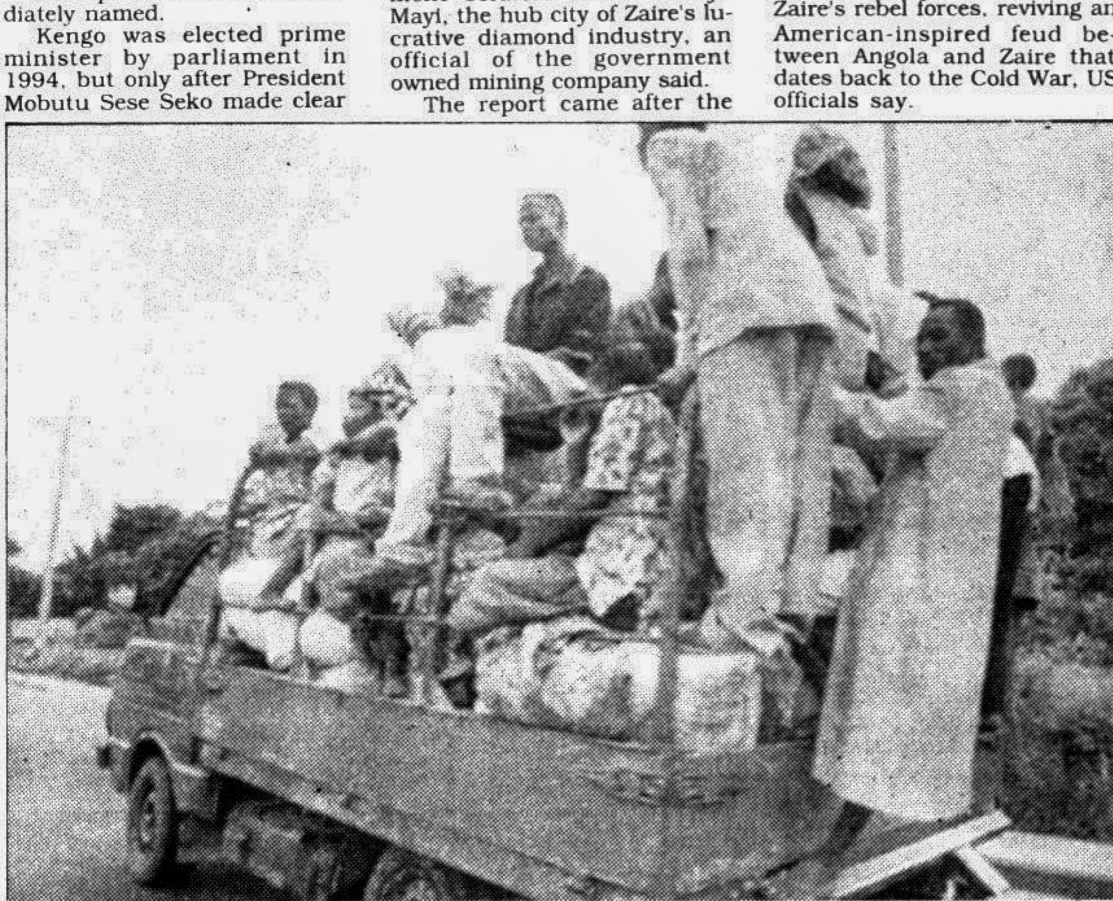
Zairean stand on a taxi that drives out of Kinshasa Tuesday. As military patrols are on duty in Kinshasa, the population fears a replay of the pillaging, looting and rape that reportedly accompanied the Zairean army retreat. The government Monday urged Zaireans not to panic and said that Mobutu Sese Seko would return home next weekend.

Another report says: Angola has put between 1,000 and 2,000 Zairian exiles at the disposal of Zaire's rebel forces, reviving an American-inspired feud between Angola and Zaire that dates back to the Cold War, US officials say.