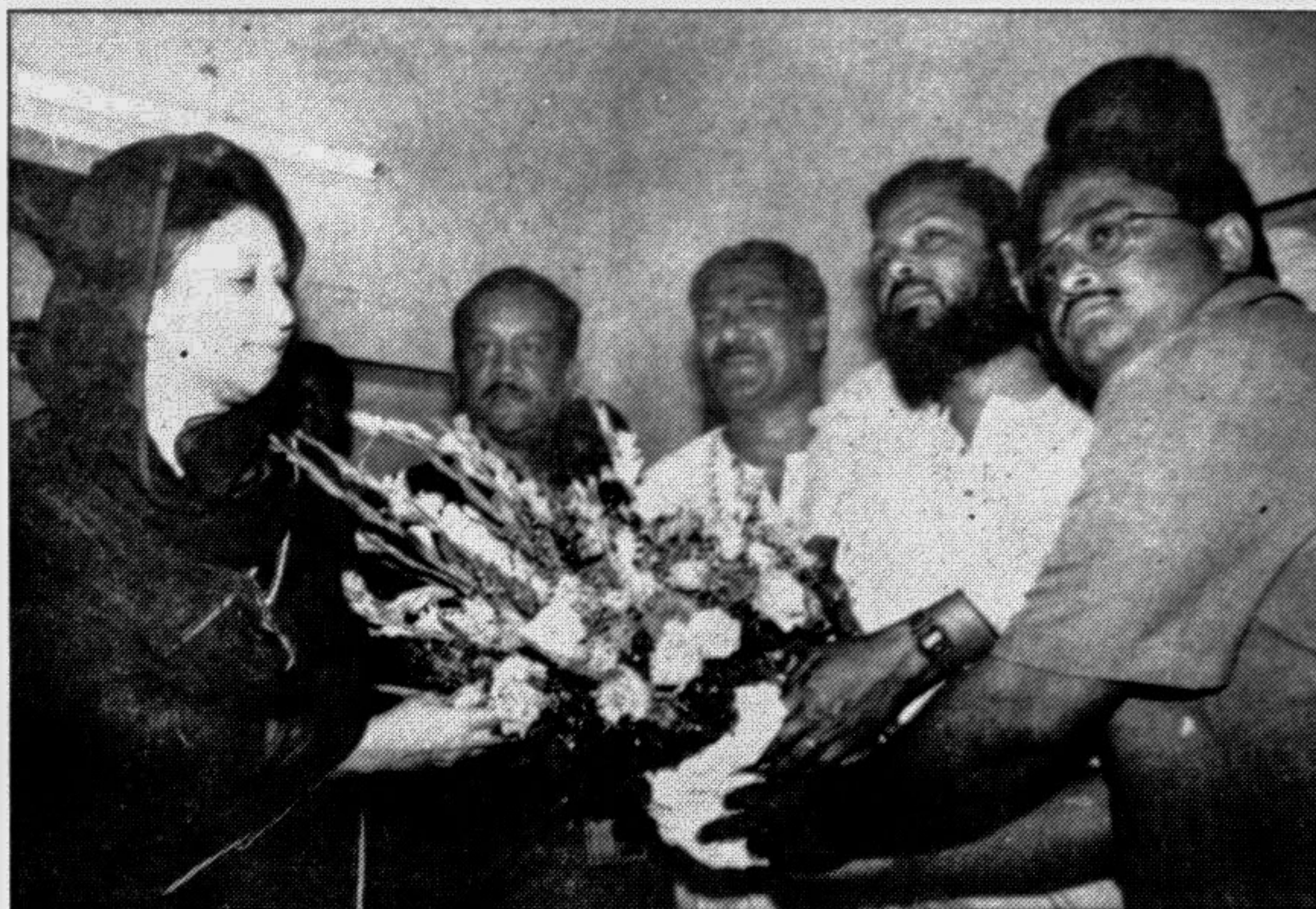
BNP chairperson Begum Khaleda Zia receiving a bouquet from some leaders and workers of Natore District Jatiya Samik Party who joined her party in the city yesterday.