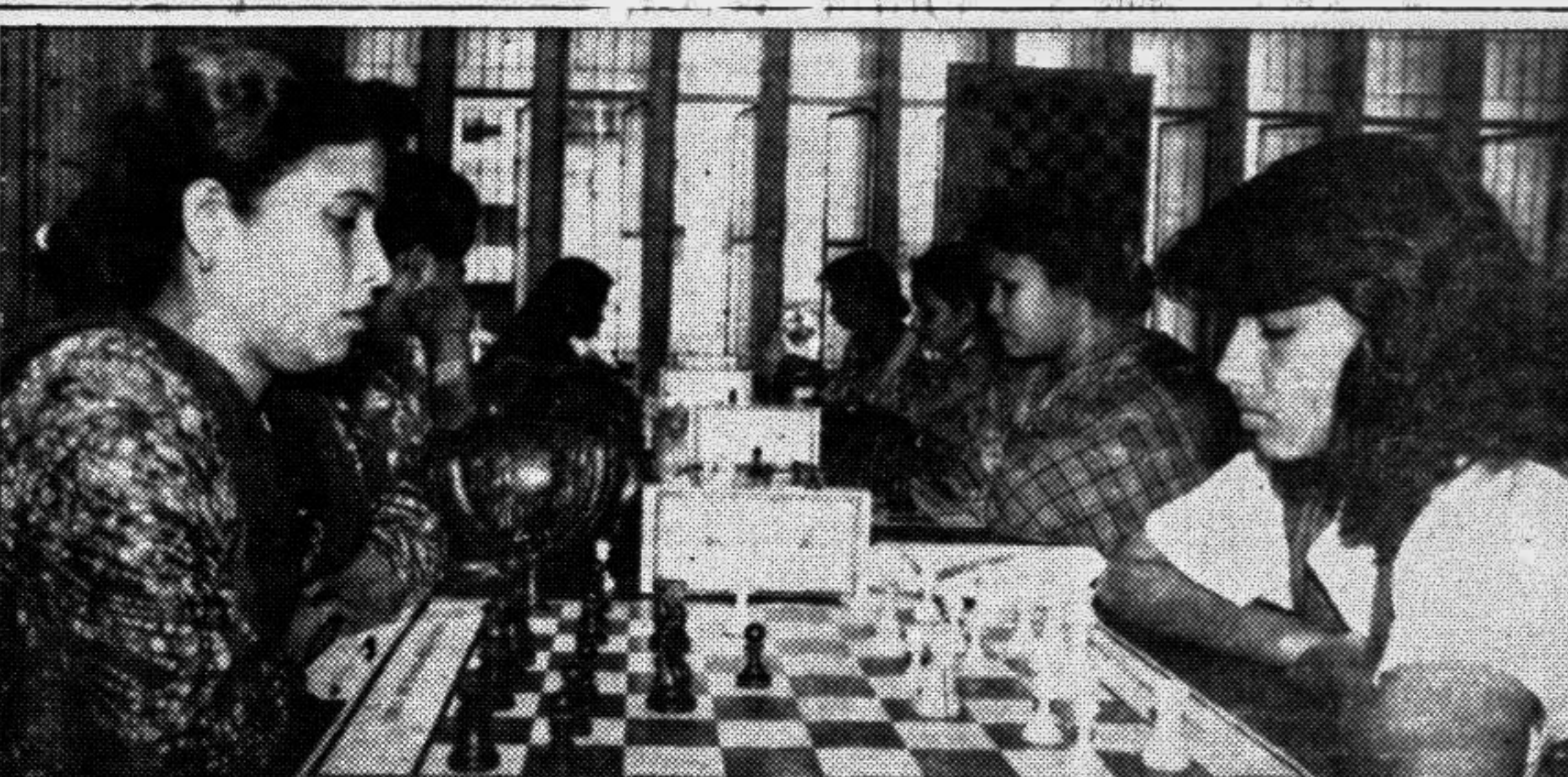
Scene from yesterday's fourth round matches of the 18th national women's chess championship qualifying round at the NSC chess room.

Valencia, who beat defending champions Bayern Munich in the first round, entertain another German side in Schalke 04 but have a 2-0 deficit from the first leg to make up — however, with their recent Argentinean signing Ariel Ortega fully acclimatised the Spanish side could well make home advantage tell.