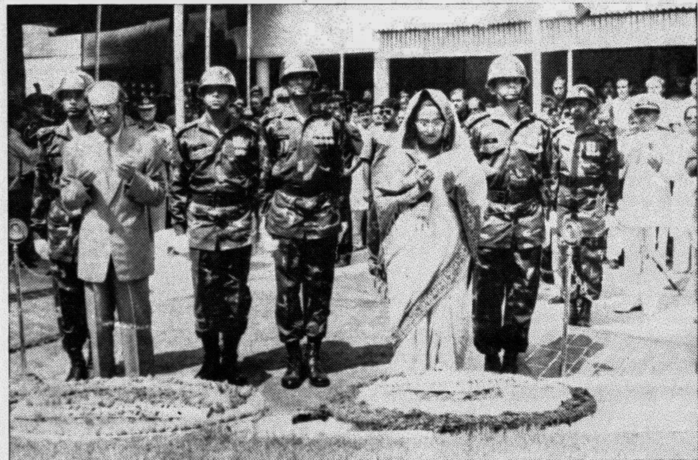
President Shahabuddin Ahmed and Prime Minister Sheikh Hasina offering prayers after placing wreaths at the Mazar of Bangabandhu Sheikh Mujibur Rahman in Tungipara yesterday.