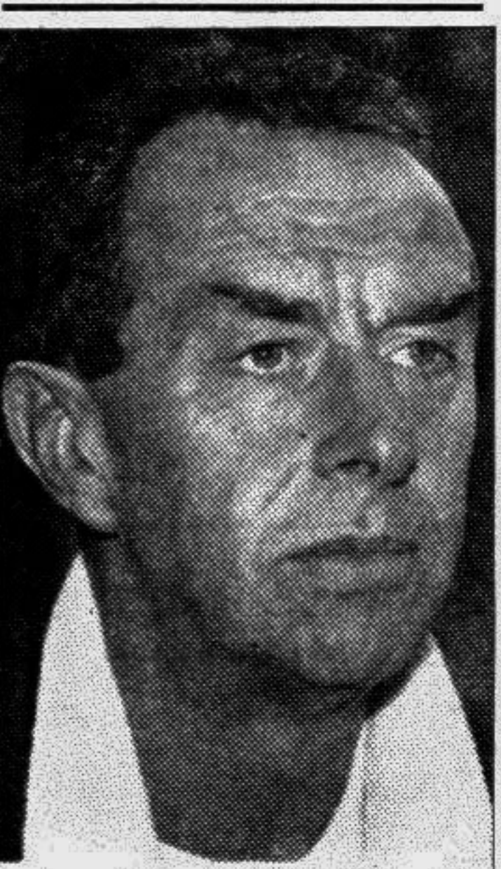
David Lloyd (England cricket coach) "He's a tough little fella." On Mike Atherton.