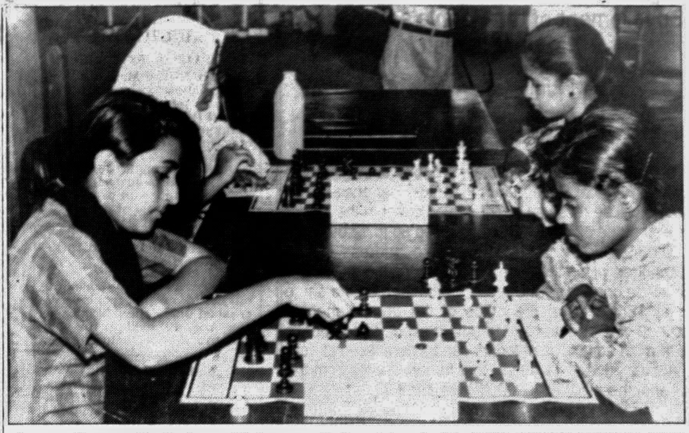
A scene from yesterday's qualifying round of matches in the 18th national women's chess championship at the NSC chess room.

ADELAIDE, Mar 16: Former world record-holder Samantha Riley clipped half a second off her Olympic 200-metre breaststroke time here Sunday and started talking of regaining her world crown, reports AFP. Australian Rebecca Brown, who holds the world record, was left in fifth place today and was put on notice that her two minutes 24.76 seconds record will be one of Riley's main aims over the next 12 months. "I'm nowhere near 100 per cent fit so if I can do that sort of time now I know I can get back down there," said Riley who touched in 2:27.43. "I know I have the ability to swim faster than the world record," she said. Riley finished in 2:27.91 in the Olympic final won by South African Penny Heyns in 2:25.41.