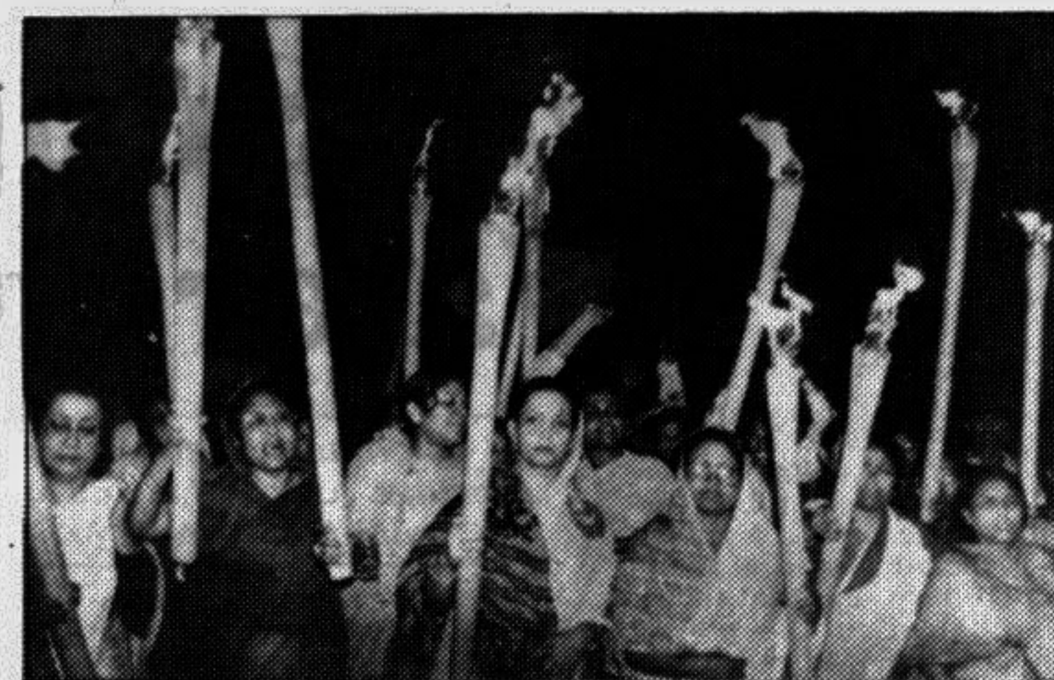
The Dhaka metropolitan city unit of the Jatiya Party brought out a torch procession in the city yesterday in preparation of a grand rally at city's Manik Mia Avenue tomorrow. Party Chairman HM Ershad is scheduled to address the rally.

Second: Rhone-Poulenc Rorer Bangladesh Ltd. Third: i) USIS, Educational Advising Center and ii) Aviana Transport & Travel Limited (jointly).