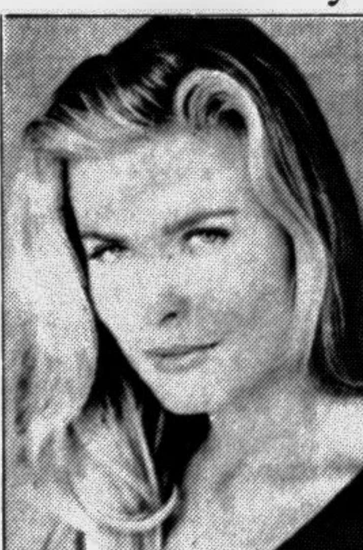
Vendela Thommessen, an internationally known model, actress and celebrity spokesperson for UNICEF arrived in the city yesterday on a three-day visit to Bangladesh, reports BSS.

The purpose of her visit is to learn about the work of UNICEF and how it works in collaboration with the government, NGOs, donors and community leaders for the benefit of children and women, a press release said. Girl child, children's and women's right and child labour issues will be of particular focus to her.