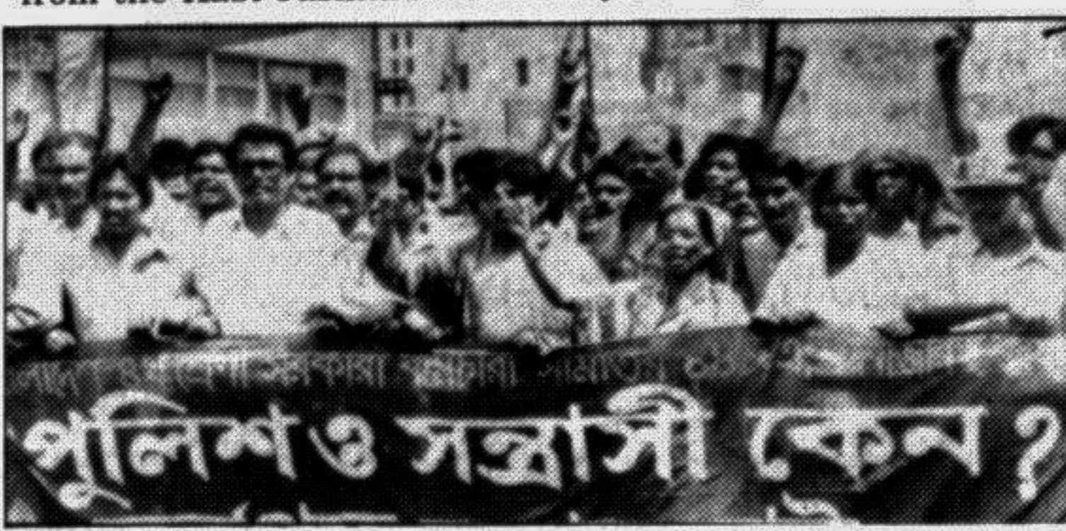
The Bangladesh Sarkari Karmachari Samannya Parishad (Government Employees' Coordination Council) brought out a procession protesting the presence of mastaans in the office of the Class Four Employees Association at Maghbazar yesterday.