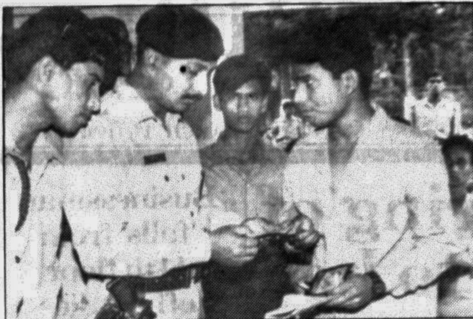
Police checking identity cards of the resident students before their entry into DU halls following the armed clashes between JCD factions. The photograph was taken from the Kabi Jashimuddin Hall yesterday.