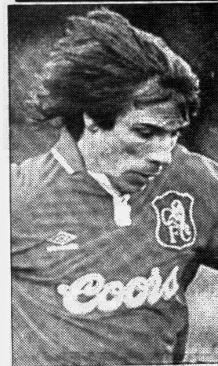
Gianfranco Zola (Italian soccer player) 'England will always try to break through a brick wall. We Italians try to find a way around it.'

MANCHESTER, Mar 15: Manchester United manager Alex Ferguson dismissed Italian newspaper reports Friday that he has launched a five-million-pound (7.95 million dollars) bid for AC Milan midfielder Zvonimir Boban, reports AP.