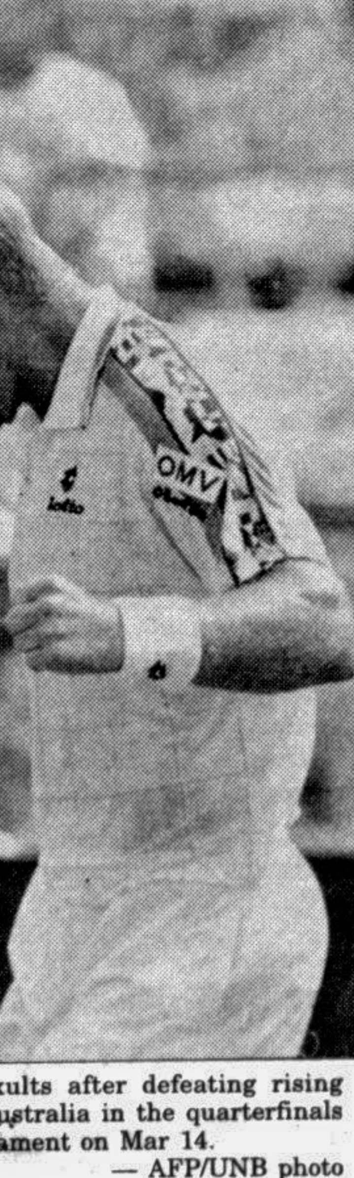
Austrian Thomas Muster exults after defeating rising star Mark Philippoussis of Australia in the quarterfinals of the Champions' Cup tournament on Mar 14.

BUENOS AIRES, Mar 15: Argentine revelled on March 7 after their capital made the shortlist to host the 2004 Summer Olympics and President Carlos Menem rushed to take credit and turn sports into politics during an election year, reports Reuters.