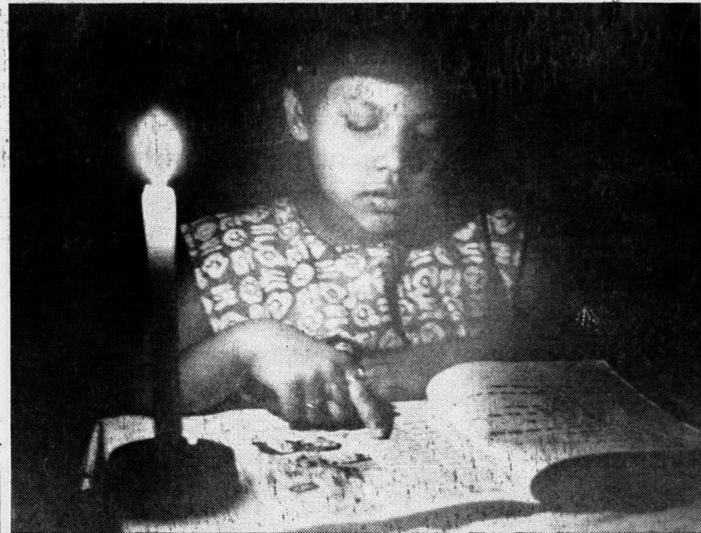
A schoolgirl studying in candlelight as power crisis plagues city life.