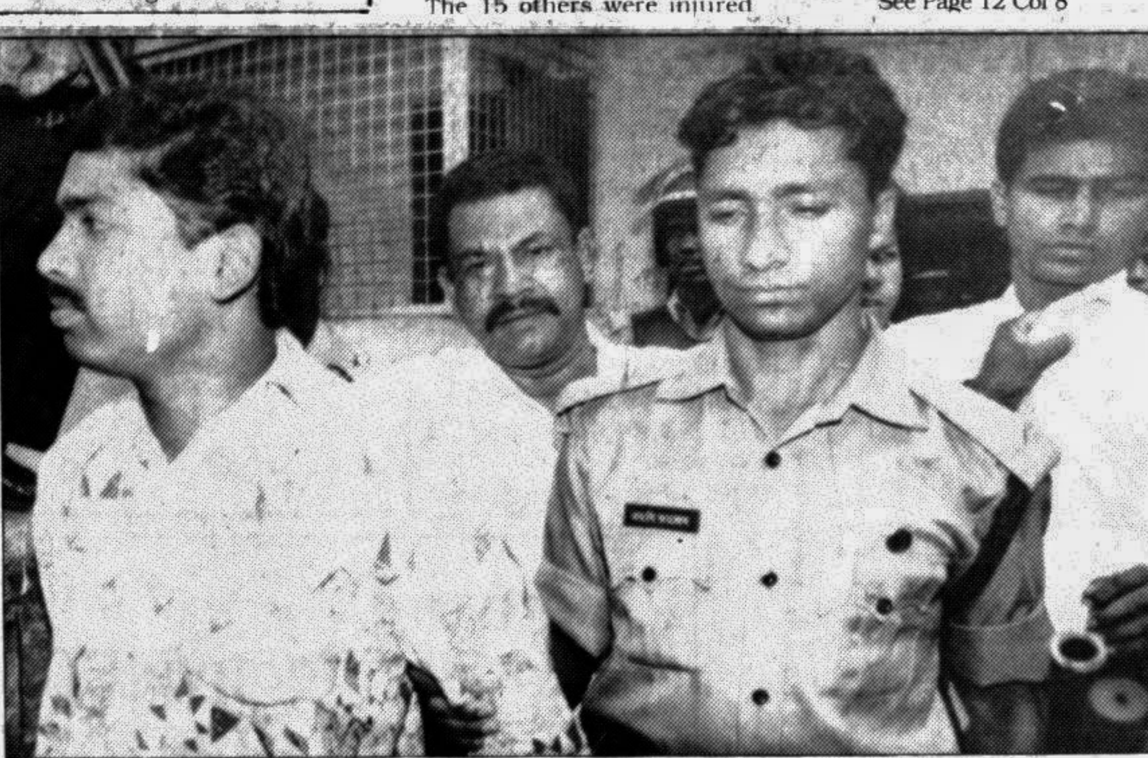
Two JCD leaders arrested during a raid in a Dhaka University hall yesterday.