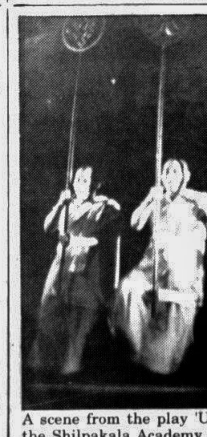
A scene from the play 'Uttara Priyadarshi' staged by Chorus Repertory Theatre of India at the Shilpakala Academy auditorium in the city yesterday.

The government has exempted import tax and VAT on electric generating sets for one year with effect from March 10, an official handout said in Dhaka yesterday, reports UNB. It said the government has also decided to provide relief in the collection of advanced income tax on generators in accordance with this exemption. The handout said the government hopes that this arrangement will make generator import easier and contribute to tackling the existing power crisis.