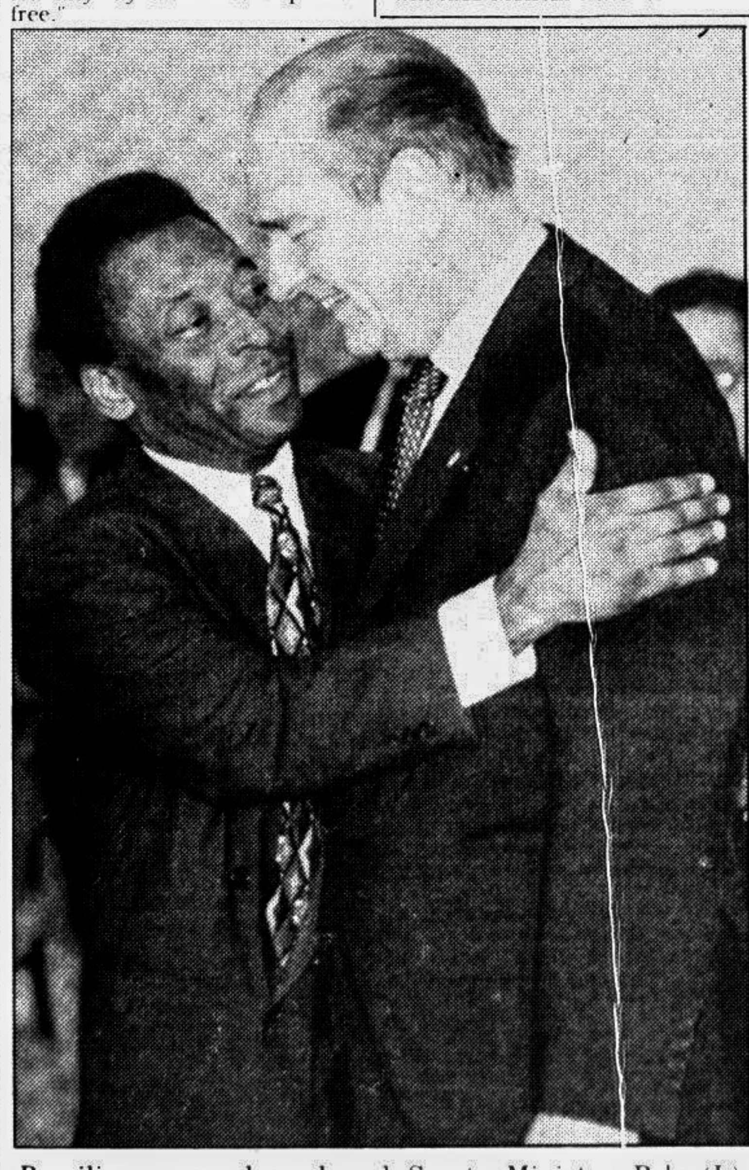
Brazilian soccer legend and Sports Minister Pele (L) greets French President Jacques Chirac at a welcome ceremony in Brasilia on March 12. Chirac is there on a three-day official visit.