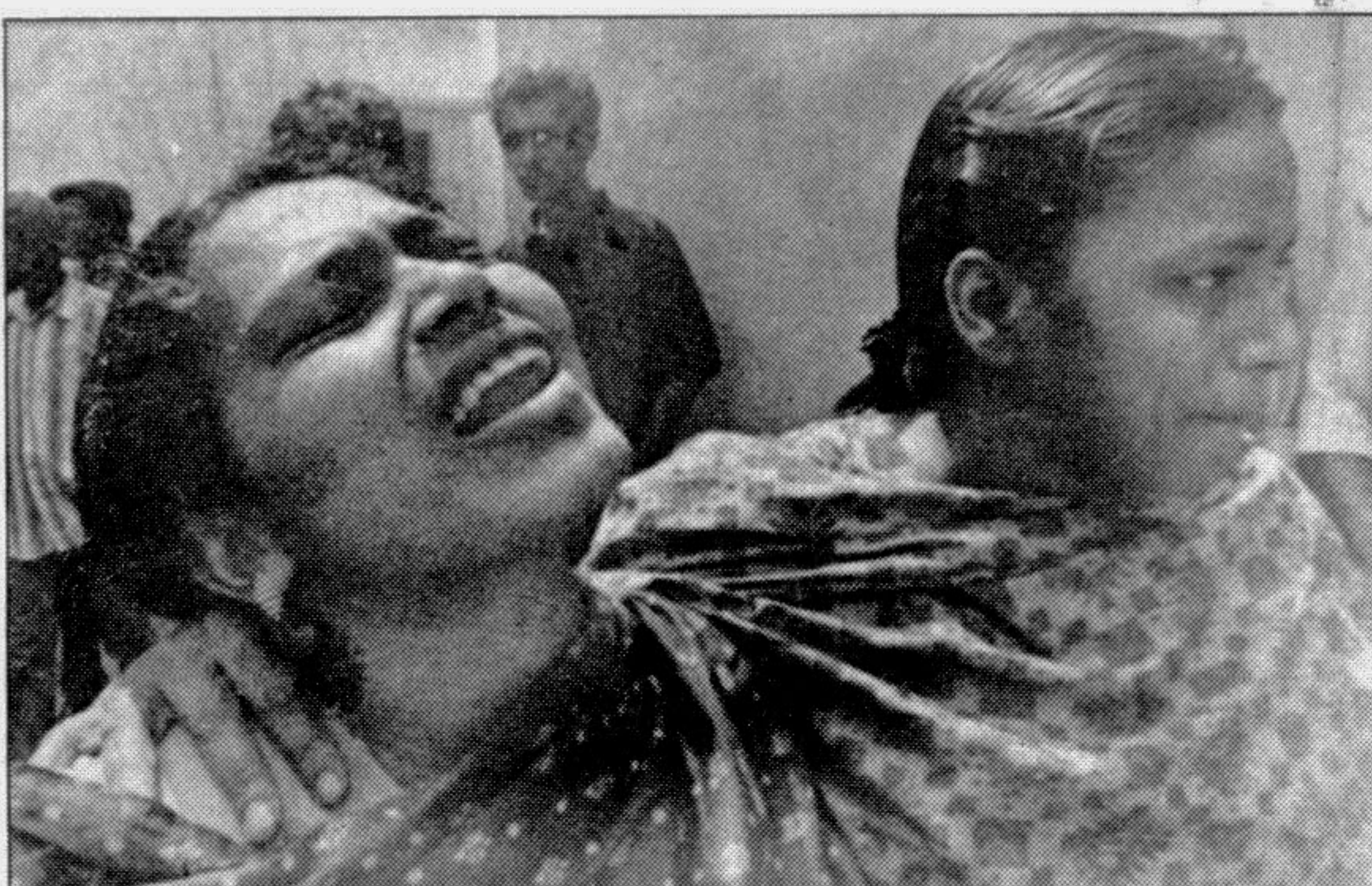
Grief-stricken relatives of a DU student who was killed yesterday.