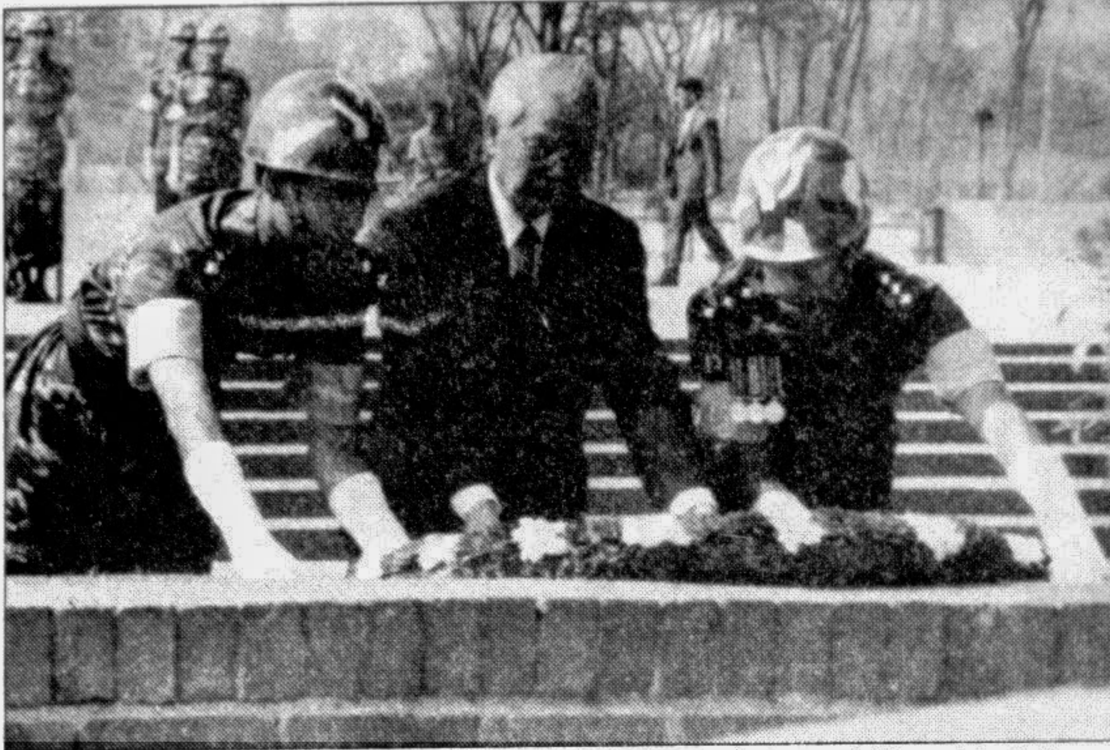
Vietnamese President Vo Van Kiet placing wreaths at the National Memorial at Savar yesterday.