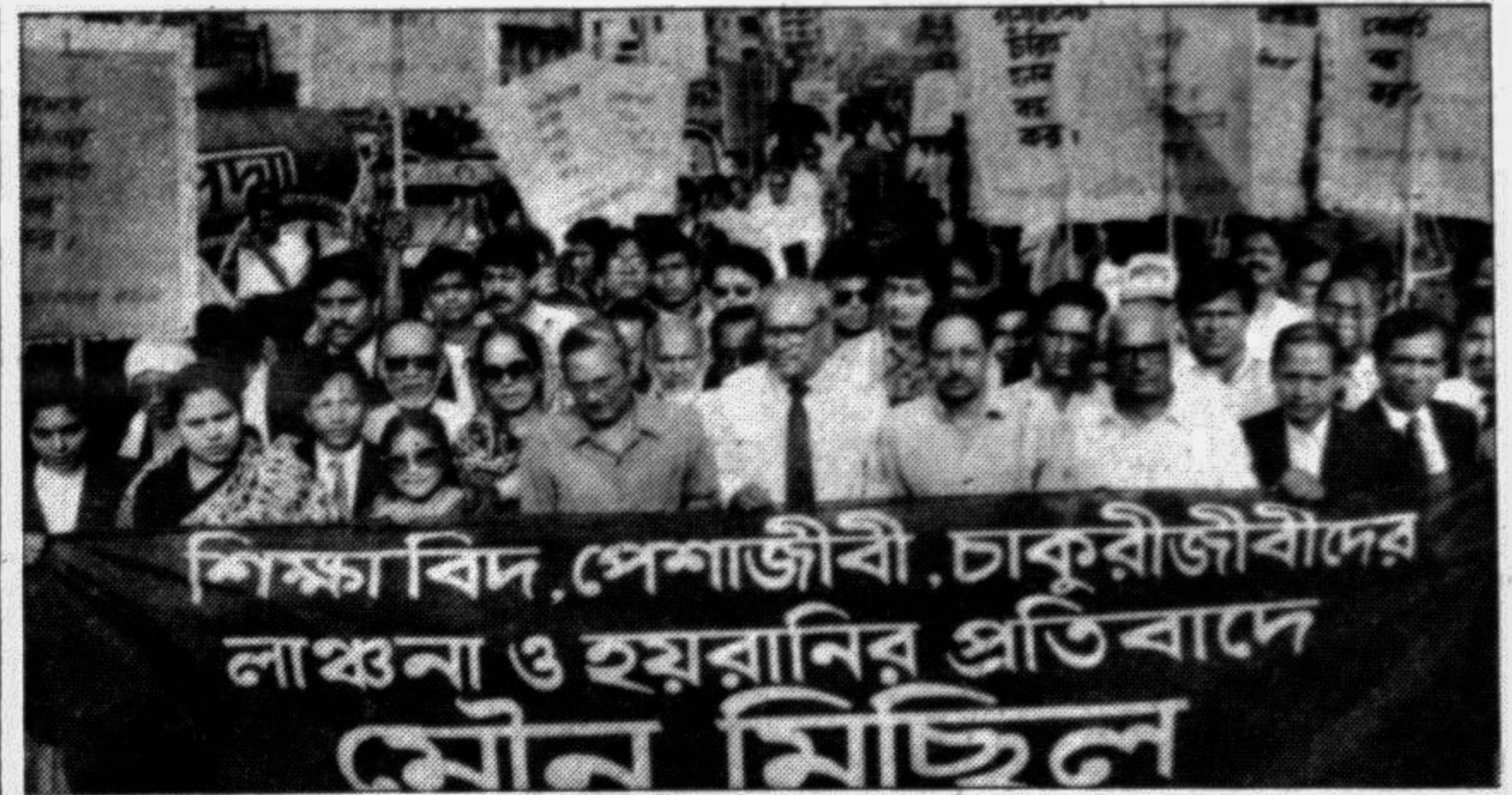
Shato Nagorik Committee brought out a silent procession in the city yesterday protesting 'harassment' of educationists, professionals and service holders.