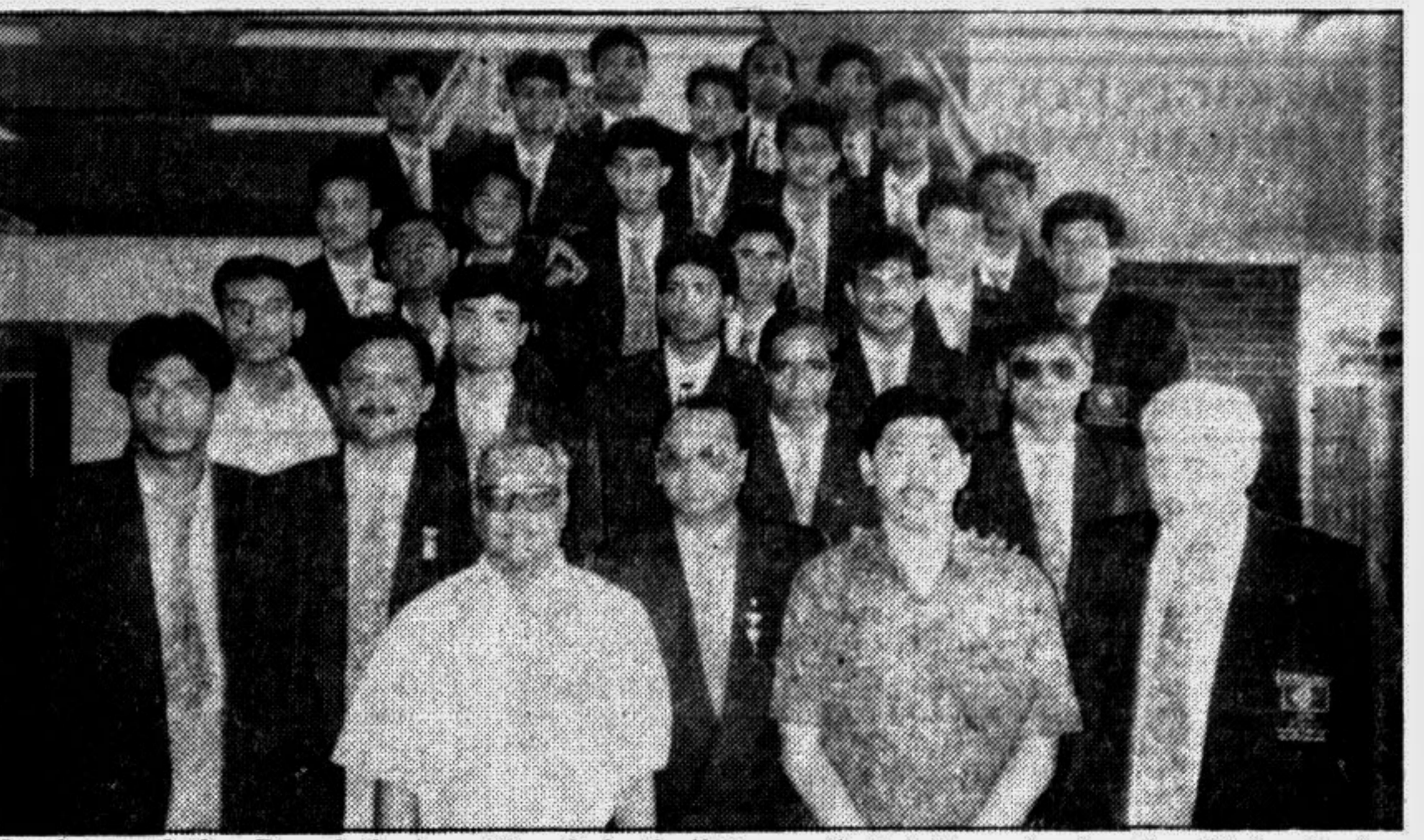
Members of the Bangladesh national football team that left yesterday for Malaysia to participate in the Asian qualifying round of matches for the 1998 World Cup finals in France.

CHITTAGONG, Mar 10: Two matches of the Bangladesh Air Force volleyball championship were held here at the BAF Base Zahurul Hoque today, reports BSS. BAF Base Bashar and Air Headquarters Unit won their respective matches in straight sets defeating BAF Base Pahar Kanchanpur and the host base.