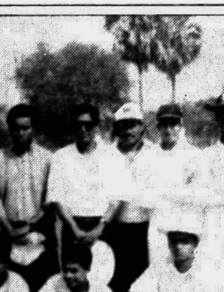
Players and officials of the Jahangirnagar University team, who clinched the inter-varsity cricket title yesterday. They beat Rajshahi University in the final.

Other recommendations include setting up a World Test Cricket championship to pre-