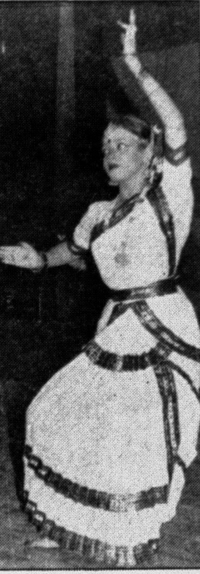
A girl performing a dance at the inaugural ceremony of the South Asian Theatre Festival organised by Nagorik Natya Sampradaya at the Shilpakala Academy in the city yesterday.