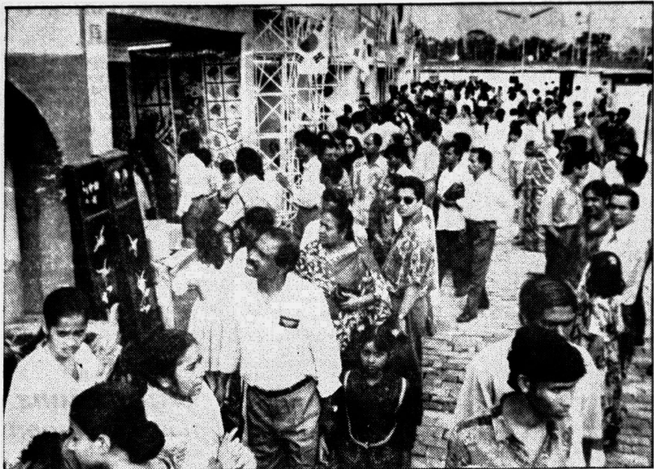
Rush of visitors at the Dhaka International Trade Fair.