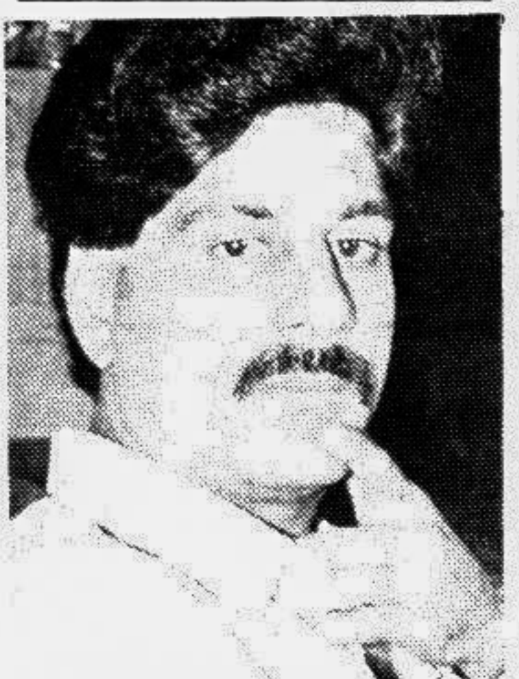
Kris Srikanth (Former Indian cricketer) It is my second innings. After being appointed manager of the India A team.