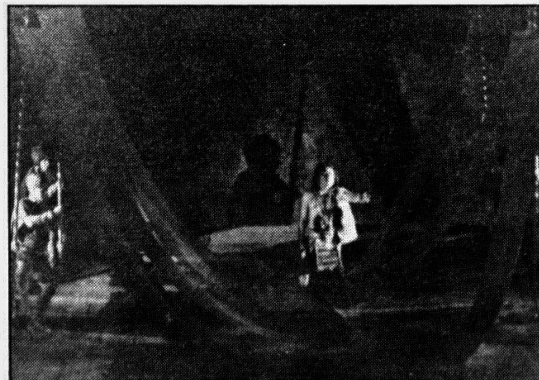
Uttariyadarshi - a play by CHORUS