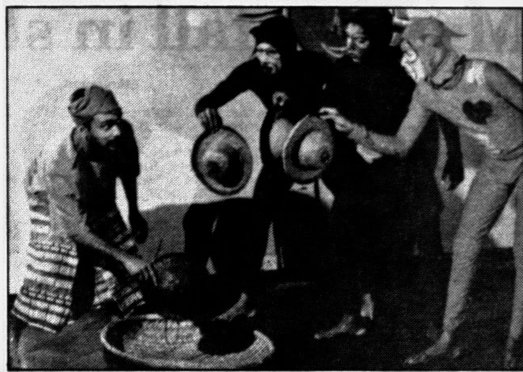
Thoppi Velenda by Lanka Children & Youth Theatre