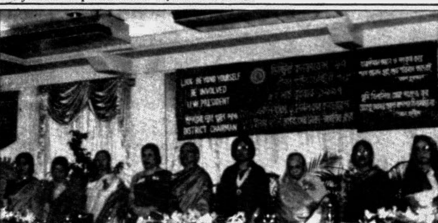
A conference of Innerwheel District 328, attended by members of 24 clubs, was held at a city hotel recently.

Cultural function: On the occasion of International Women's Day, 'International Women's Day Celebration Committee' has organised a cultural function. Venue: Dhanmondi Boys' Club premises. Time: 5 pm. It will be followed by a torch procession up to Shahbag.