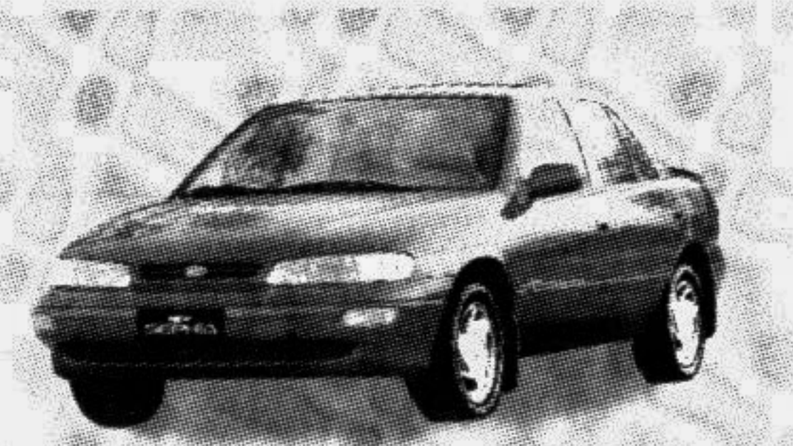
SEPHIA FAMILY SEDAN