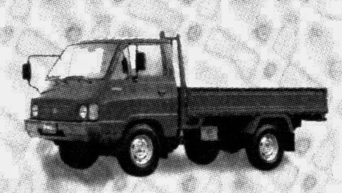
NEW CERES 2400 CC CARGO TRUCK