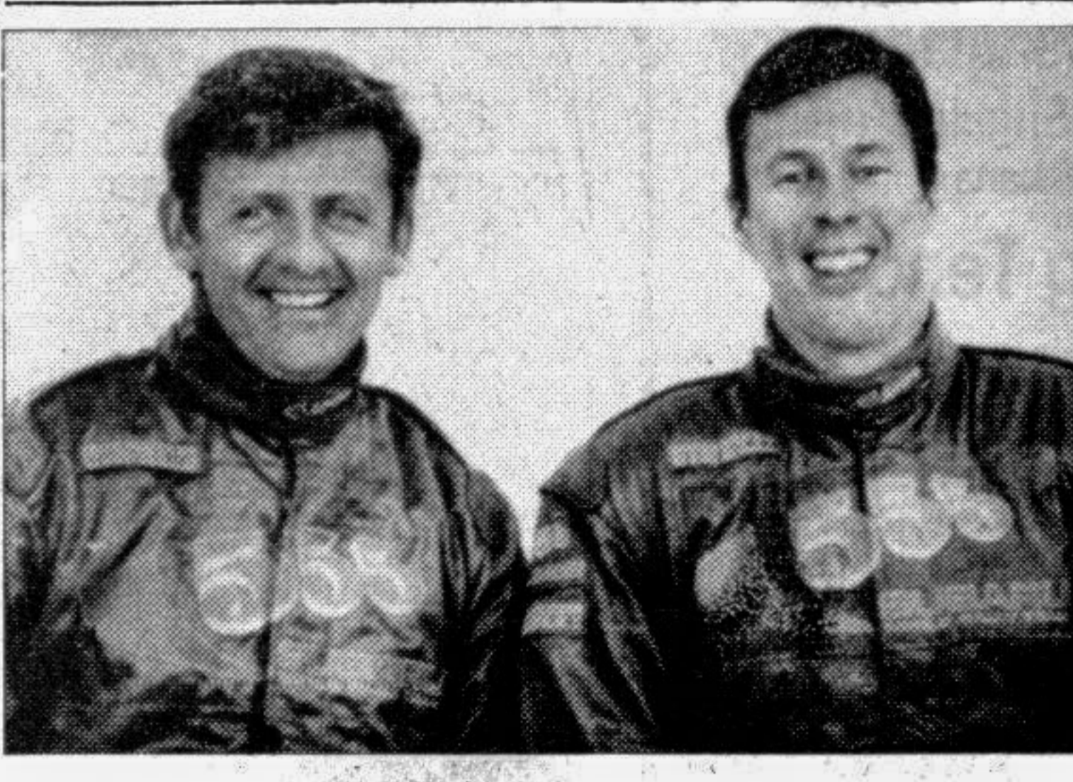
The winning 555 Subaru World Rally team