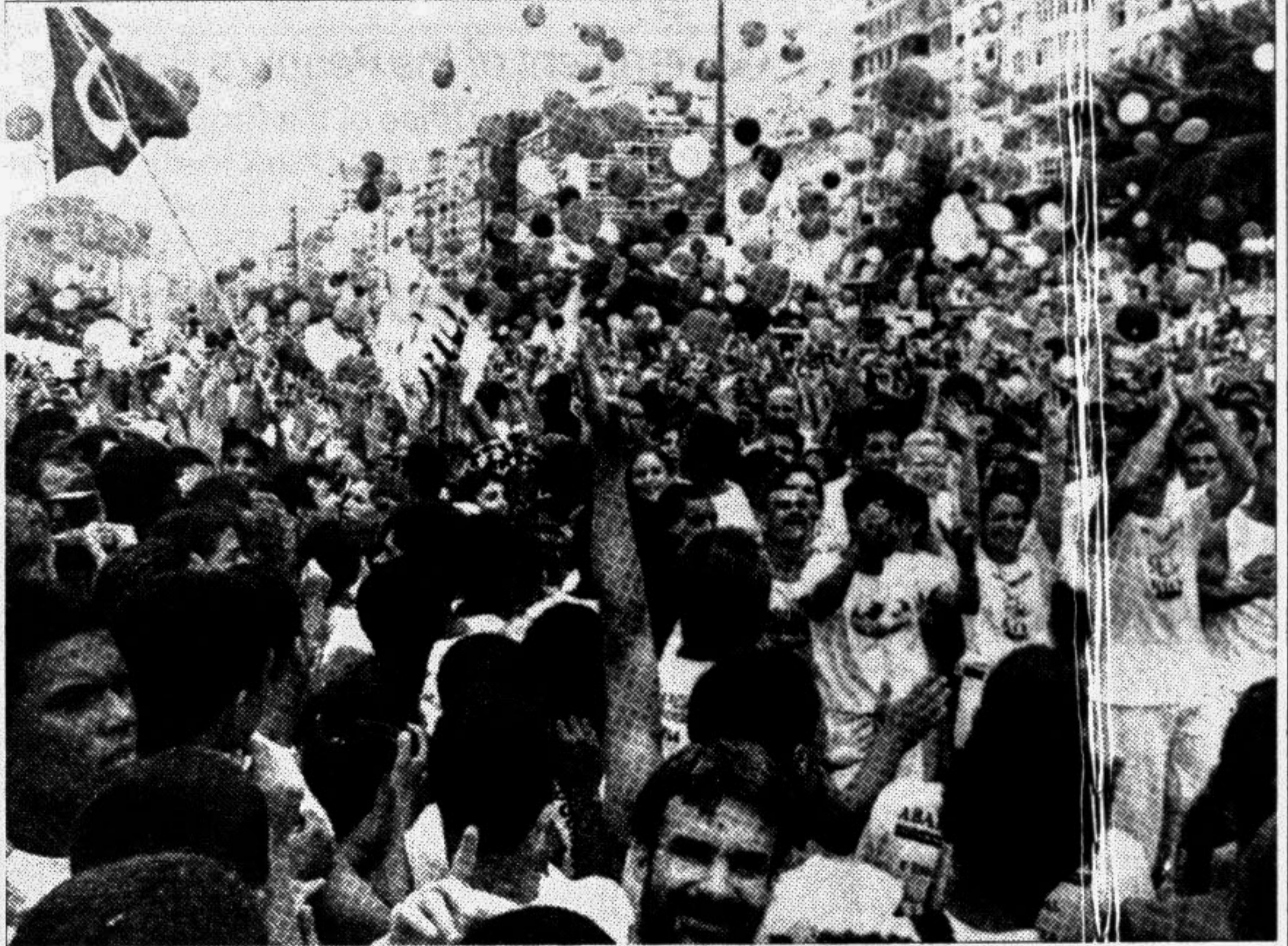
Part of a crowd estimated at one million who filled Atlantica Avenue at Copacabana beach in Brazil during a demonstration in support of Rio's bid to host the 2004 Olympic Games on Mar 2.