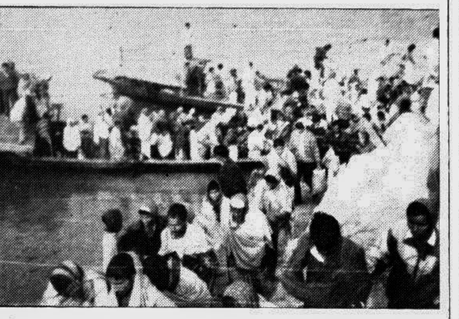
Railway passengers crossing the river Jamuna at Bahadurabad ghat heading for Teestamukh ghat.

JAMALPUR, Mar 3: The Brahmaputra river is turning into a canal due to rapid siltation. It lost its original current from its source of the eastern Himalayas down to its mouth.