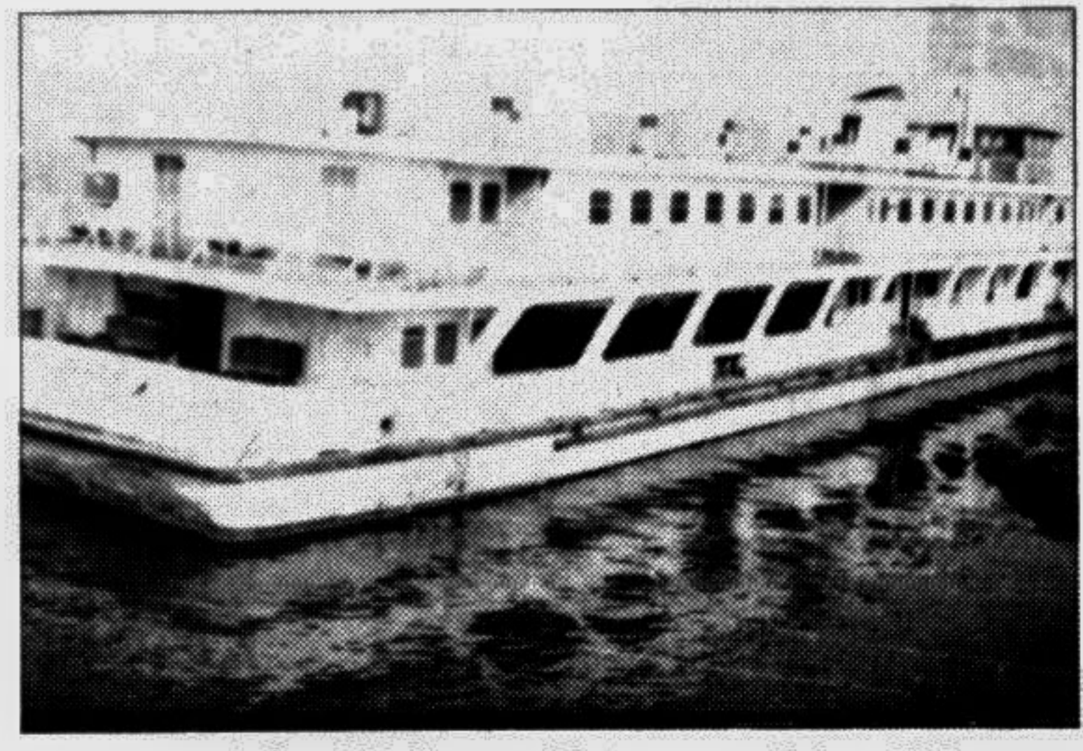
A railway ferry, MV Sarwardi lying stranded at Kalasona point on last Wednesday after it hit a hidden shoal in the mid-stream of Jamuna river.