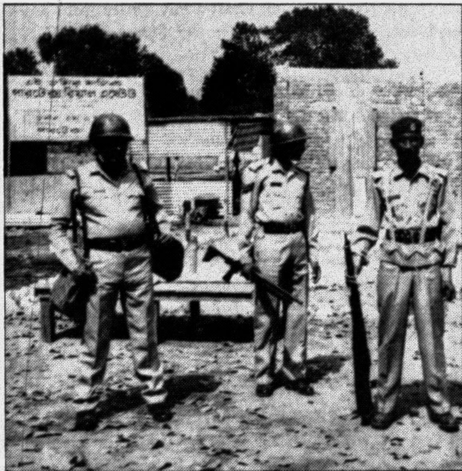
Police deployed in the area where four villagers were killed in firing by Ansars at Sadhapur village in Savar.

Dozens of gunshots that rocked Sadhapur village in Savar leaving four people dead on Friday left the green hamlet and its people in a state of panic and tension. Hundreds of people of Sadhapur and its adjoining villages, about 45 km from city, started crowding the thatched huts around the Ansar camp yesterday to see, what they said, the 'devastation' caused by the Ansars and 'some hired armed mastaans'. Meanwhile, police said that four persons including a teenage girl were killed in the incident but the villagers claimed the figure was seven. Savar police added that none came to claim anyone as missing till last night. According to police sources, 84 rounds were fired during the trouble. Thirteen Ansars who were on duty at the camp were taken to Savar thana till last night while extra police forces were guarding the troubled spot at Sadhapur. Four persons, including a teenage girl, were killed and at least 25 others injured when Ansars opened fire during a See Page 12 Col 1