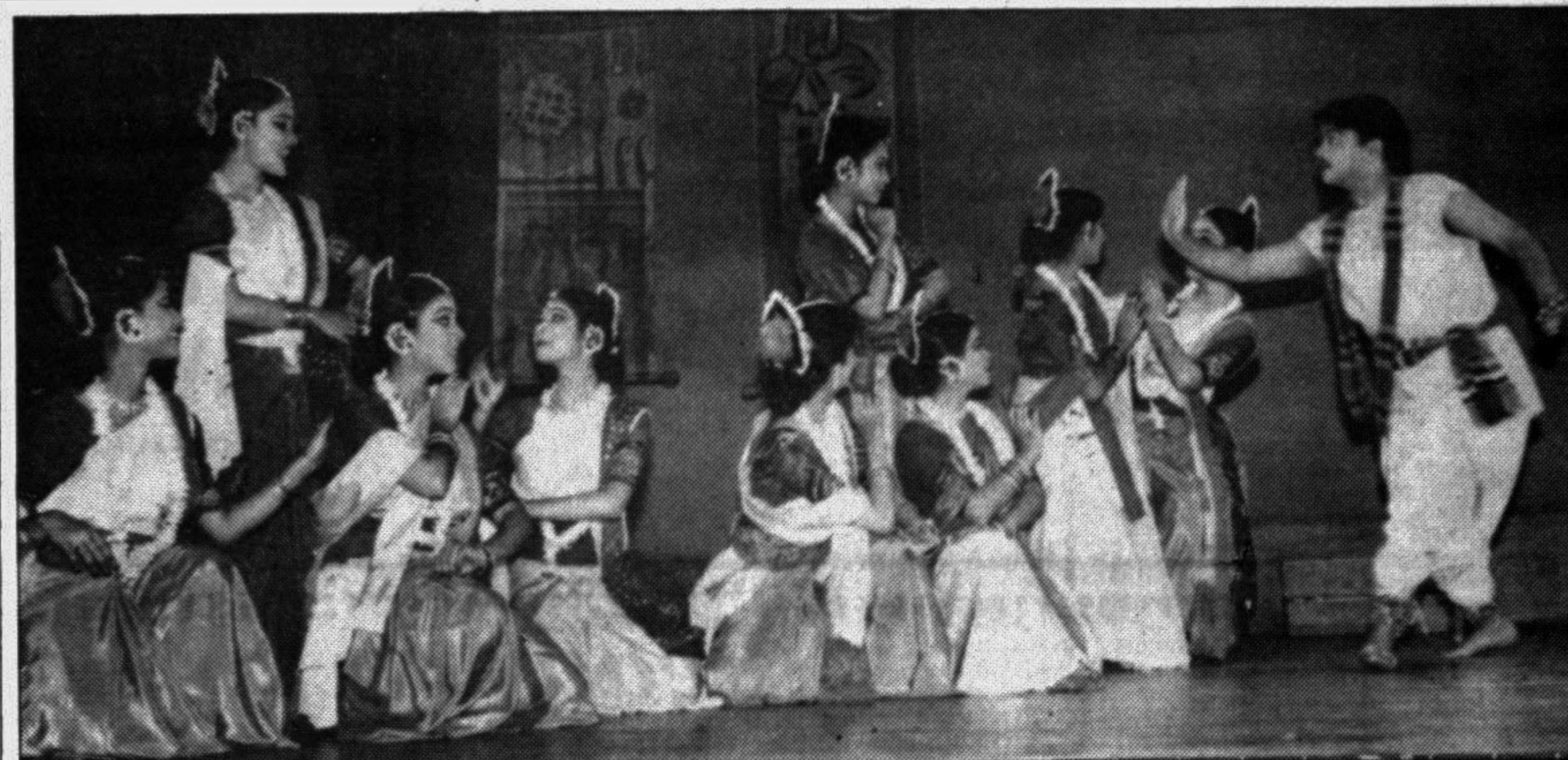
A ten-day Dance Festival organised by Shadhona began at the National Museum auditorium in the city yesterday with the superb rendering of Tagore dance drama 'Chondalika'.

Some students of these departments, talking to the correspondent, said that they did not get necessary equipment and teachers to supervise their work in the laboratories. Sometimes they have to work in groups, some of them said.