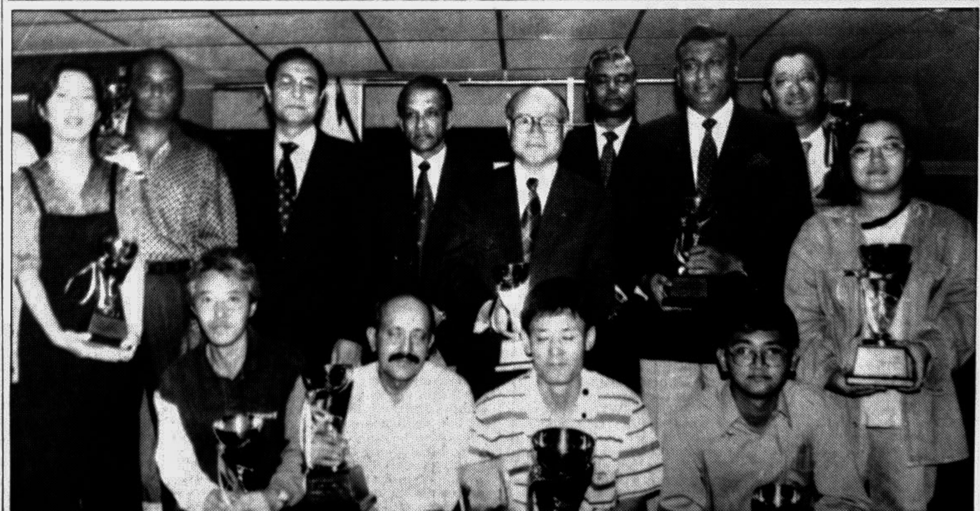
Winners and participants of the Lancer Golf Tournament '97 after the prize distribution ceremony at Golfers Inn, Kurmitola Golf Club, yesterday. Golfers from home and abroad took part in the day-long tourney, organised by Rangs Limited.