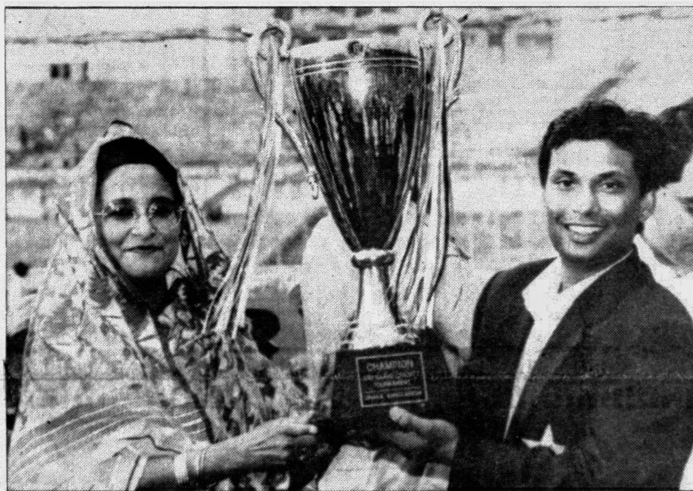
Pakistan A captain Asif Mujtaba receives the trophy of the third SAARC cricket tournament from Prime Minister Sheikh Hasina during the award-giving ceremony at the Dhaka Stadium yesterday.