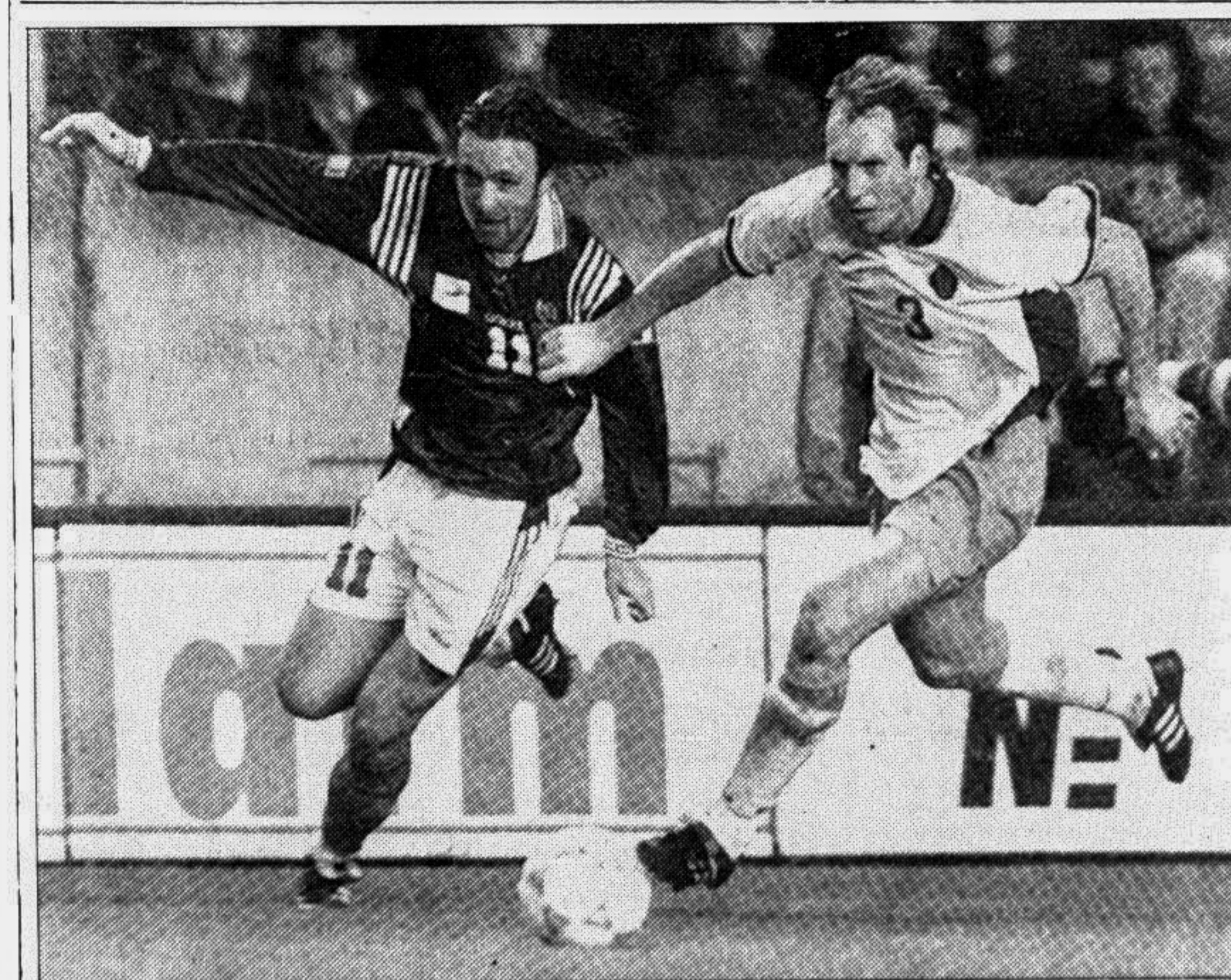
French striker Christophe Dugarry (L) and Dutch defender Frank de Boer fight for the ball during a friendly match at the Parc des Princes Stadium on Feb 26.

Former Indian Davis Cup captain Vijay Amritraj said seven other players from the world's top 20 would be in the 32-player draw.