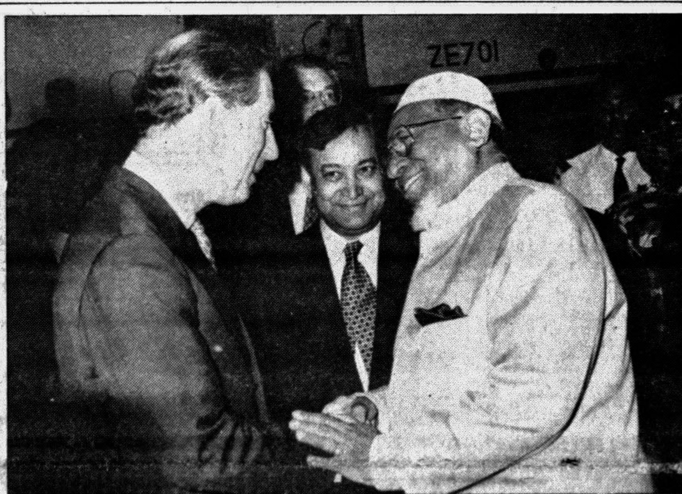
Foreign Minister Abdus Samad Azad receiving Prince Charles of Britain on his arrival at the Zia International Airport yesterday.