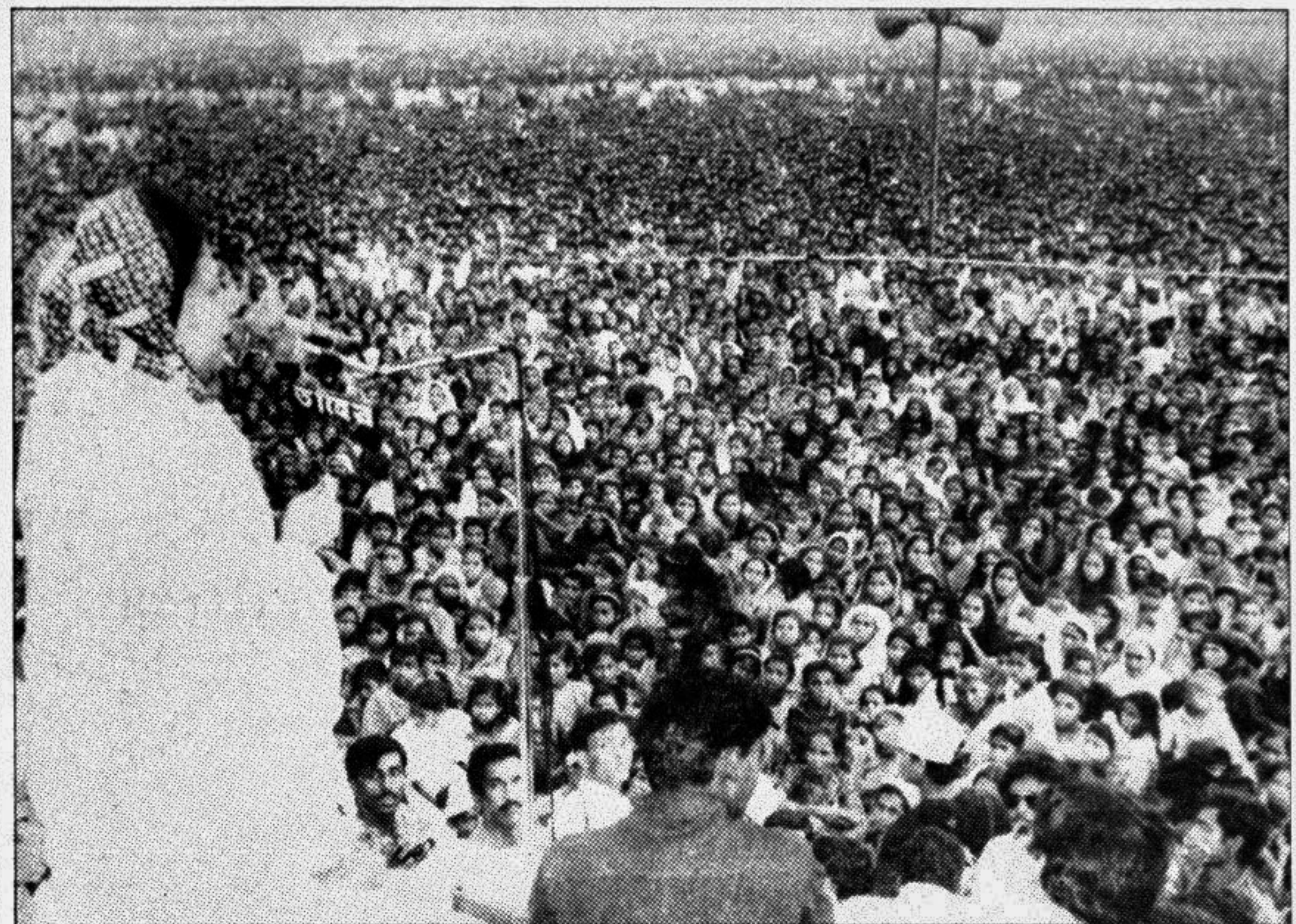
BNP Chairperson and Leader of the Opposition in Jatiya Sangsad Begum Khaleda Zia addressing a public meeting at Feni Airport yesterday.