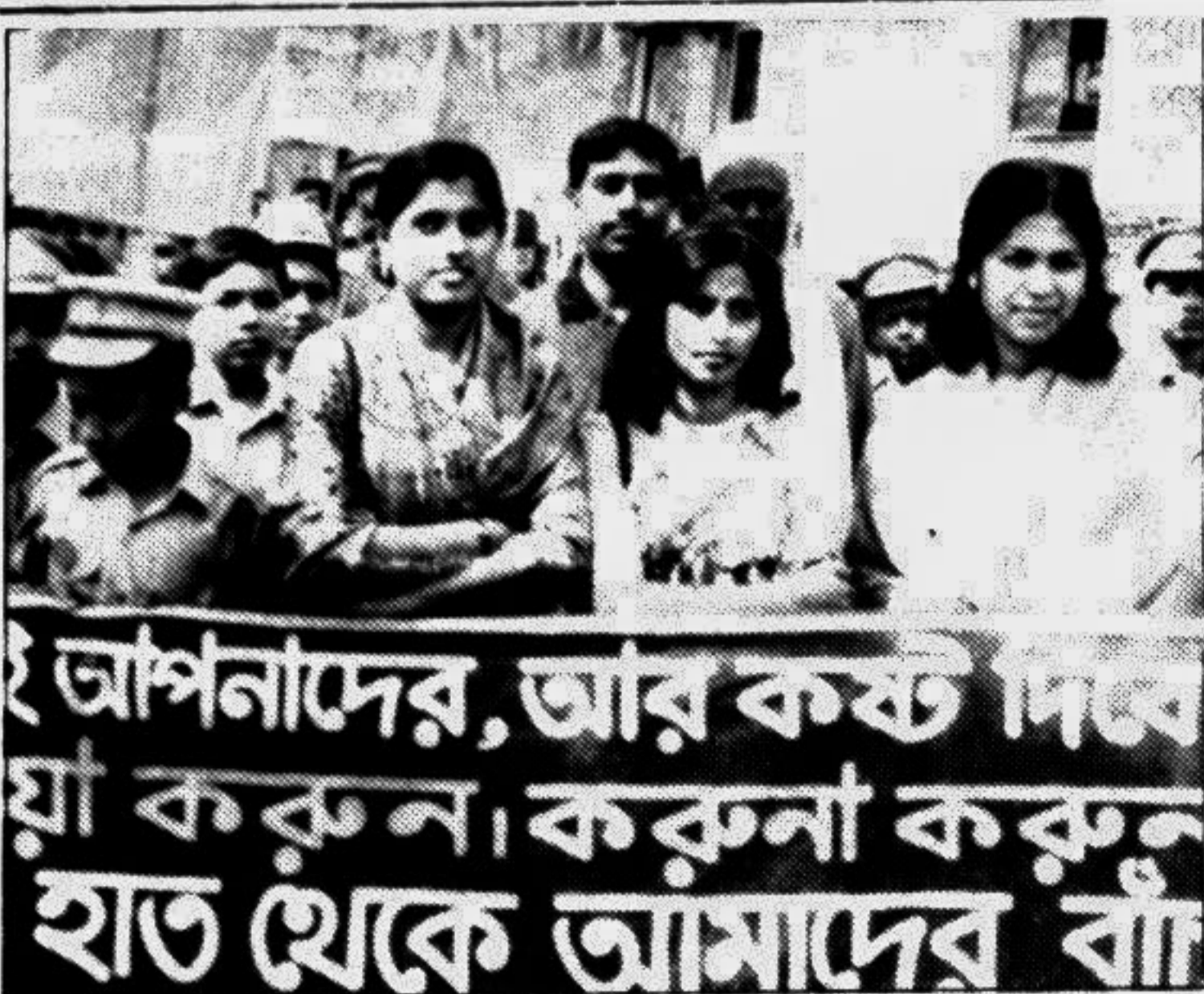
Students of a city school and their guardians brought out a procession yesterday demanding eradication of mosquito from the city.

For more information call: Head Office: 9551147/Fax: 9551112 Dhaka: 887771, Chittagong: (031) 712127, Khulna: (041) 725006