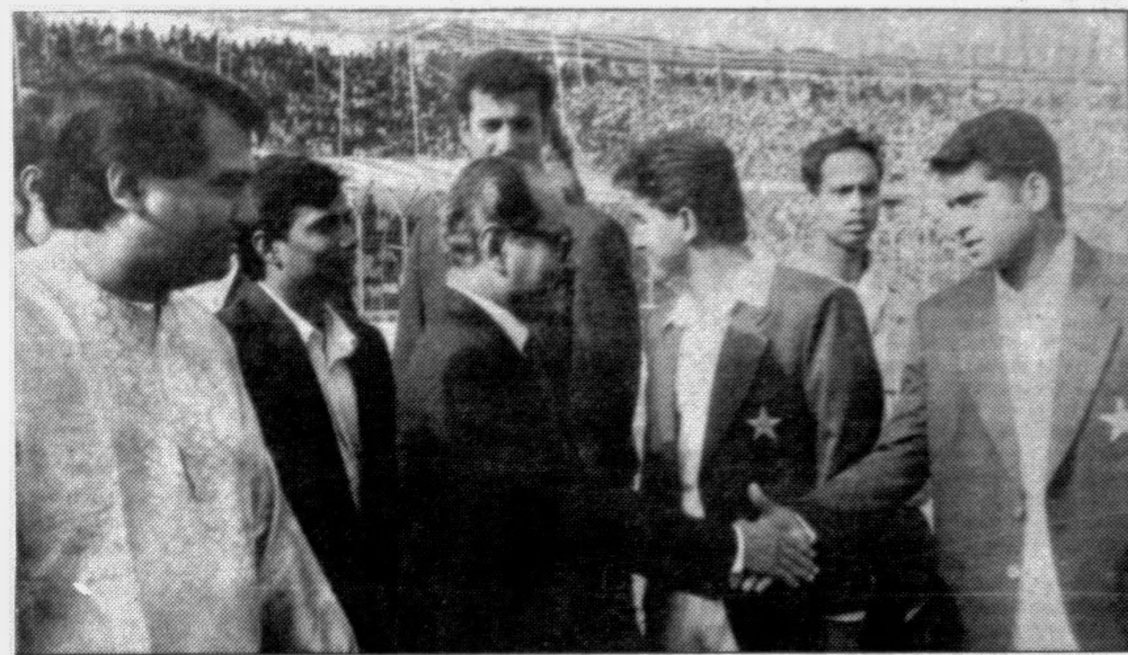
President Shahabuddin Ahmed being introduced to members of the Pakistan A cricket team before the match.