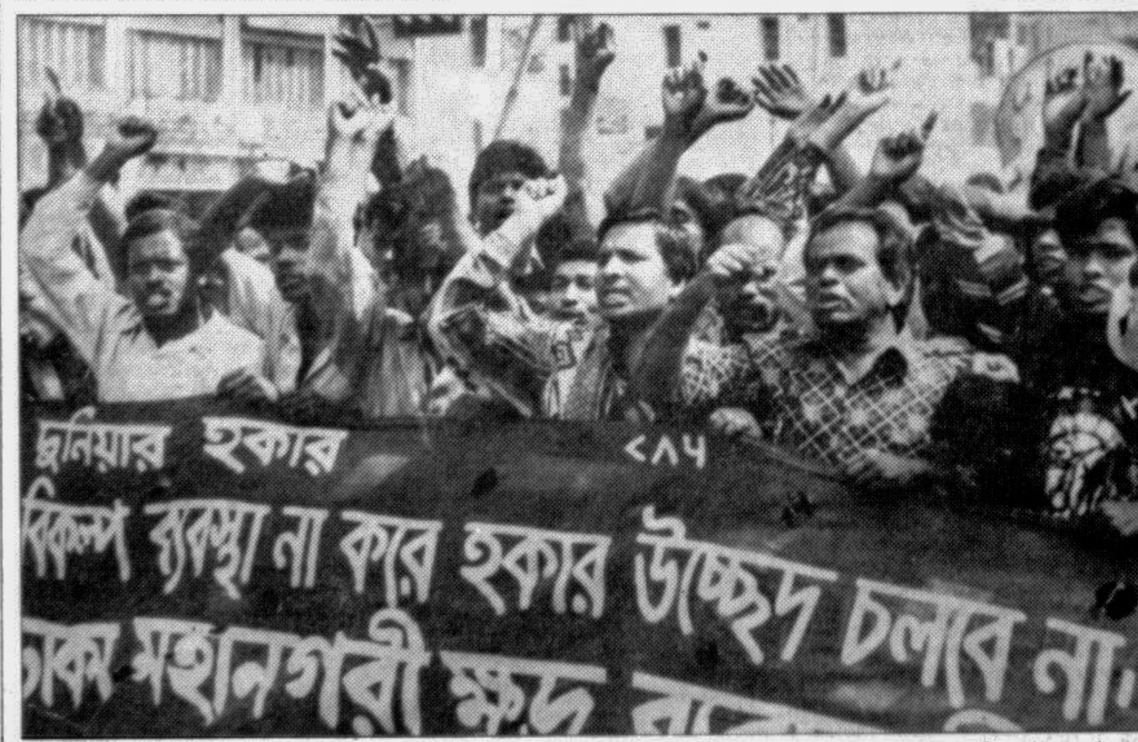
The Mahanagar Khudra Babyoshayee Samity brought out a procession in the city yesterday protesting eviction of hawkers from footpaths.