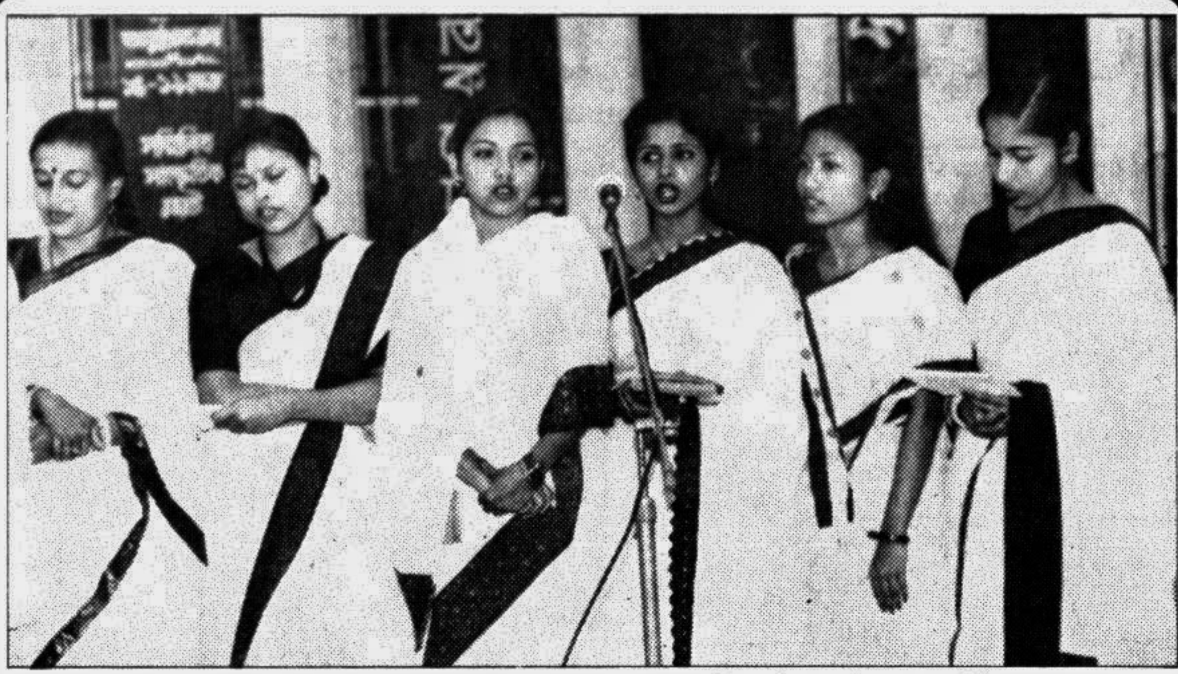
Artists of the Joy Bangla Sangskritik Jote performing at a function on Amar Ekushey at the Central Shaheed Minar in the city yesterday.