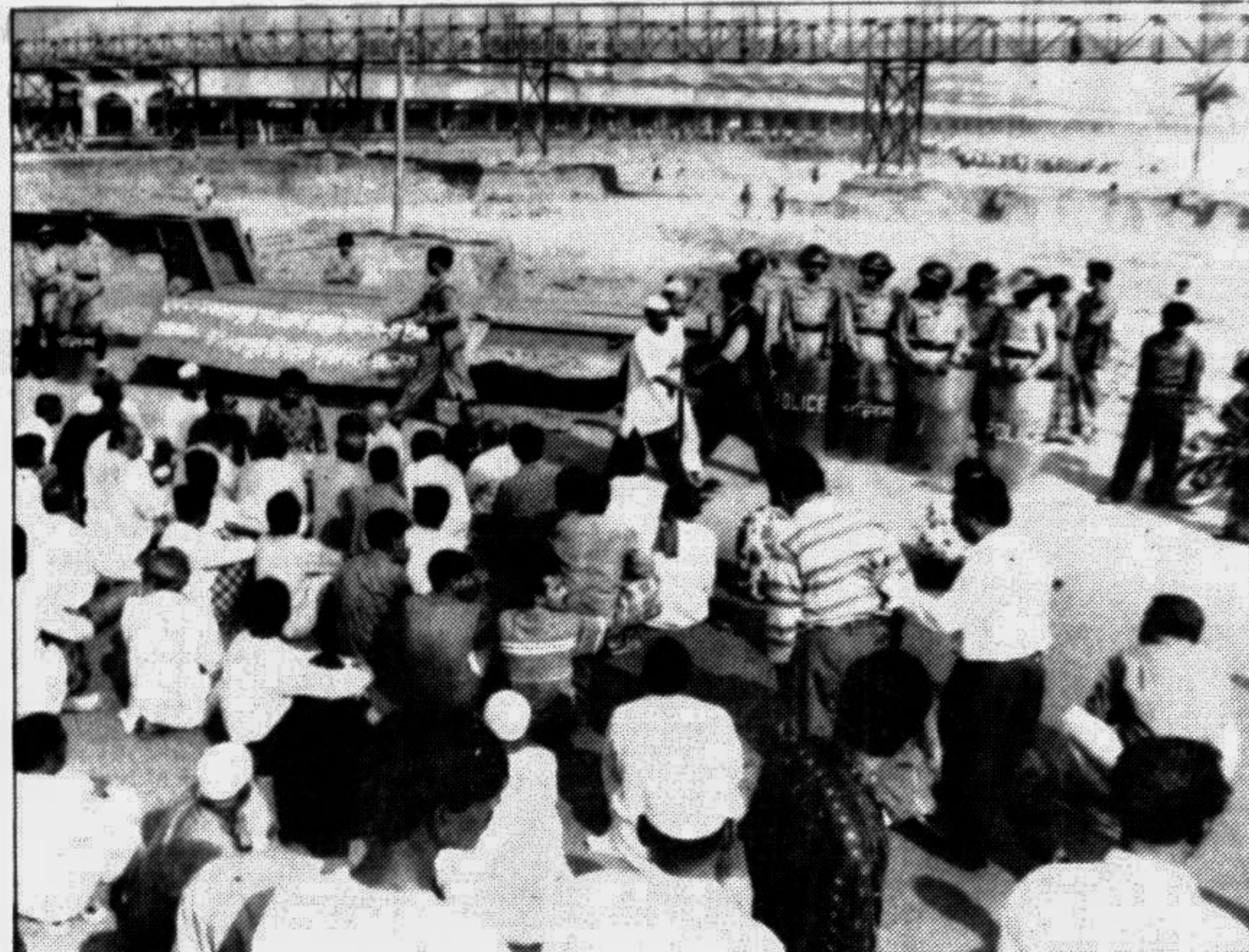
Residents of Mugdapara, Ahmedbagh, Sabujbagh and Mayakanan area staged a sit in yesterday on the Mugdapara-Kamalapur link road protesting move to close the road for ICD extension.

Advocate Bangladesh Supreme Court 10, Sakhan Nagar Lane Gandaria, Dhaka-1204 Tel: 247762