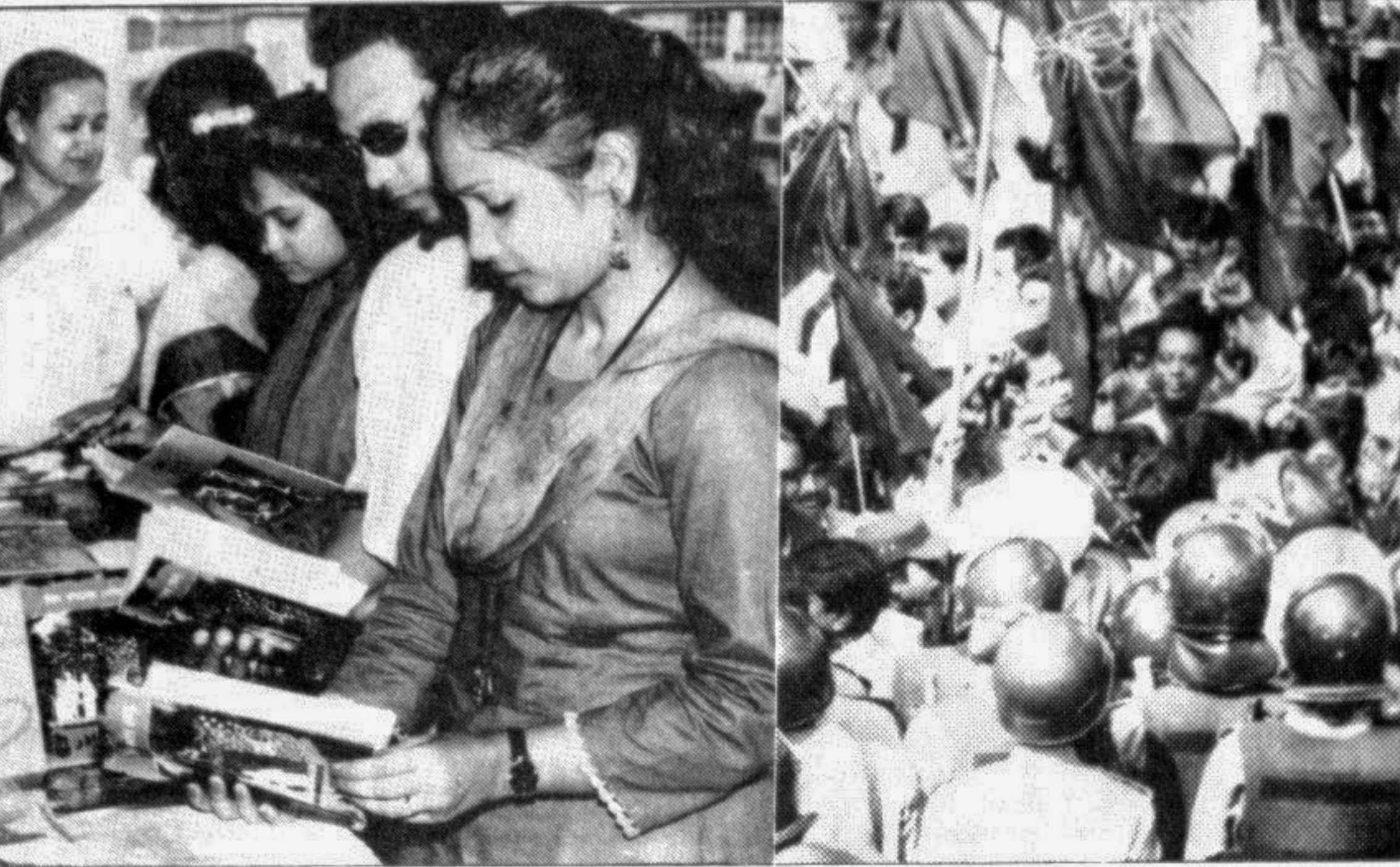
Visitors at the Ekushey Book Fair at the Bangla Academy premises (L) and JCD procession with black flags near the TSC(R) yesterday.