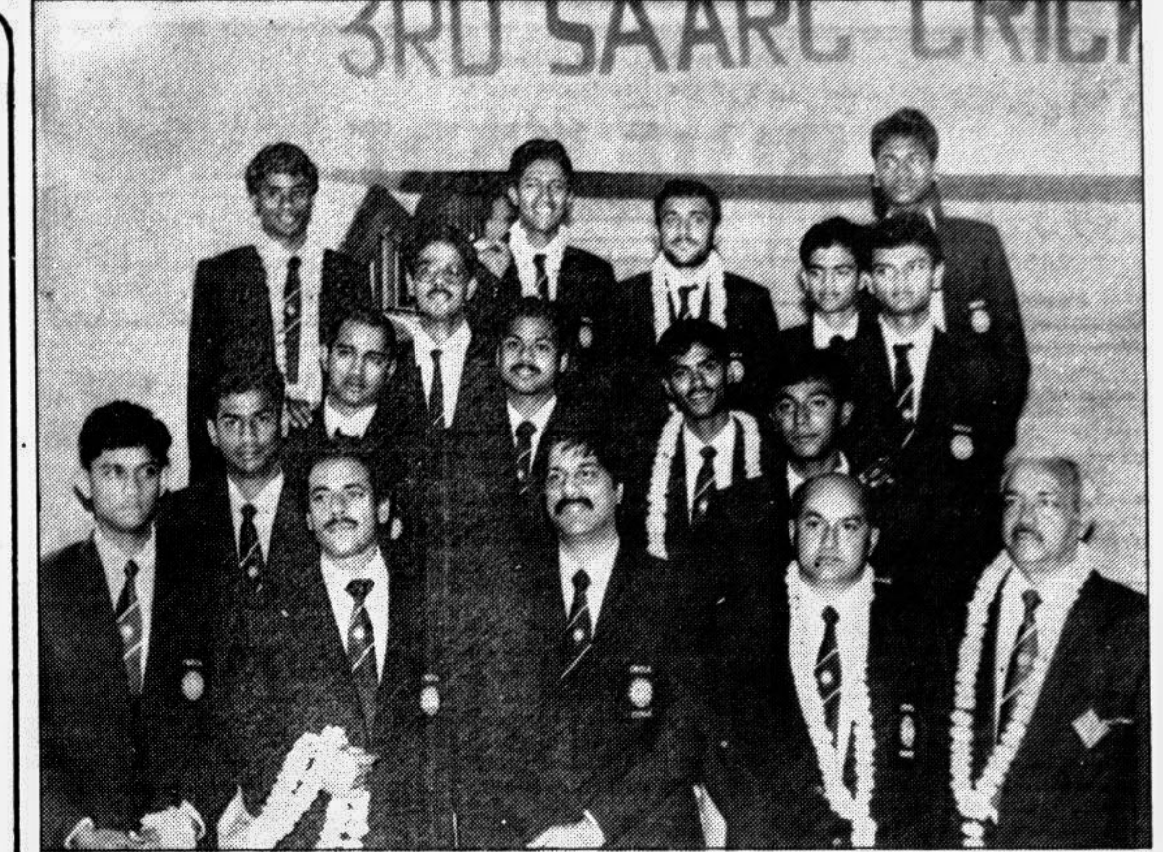
The players and officials of the India A cricket team that arrived at the ZIA yesterday to take part in the third SAARC four-nation tournament that gets underway today.

GLASGOW, Feb 18: A police probe into allegations that Rangers star Paul Gascoigne shouted abuse at a 12-year-old boy was dropped because of "insufficient evidence," police said Monday, reports AP.