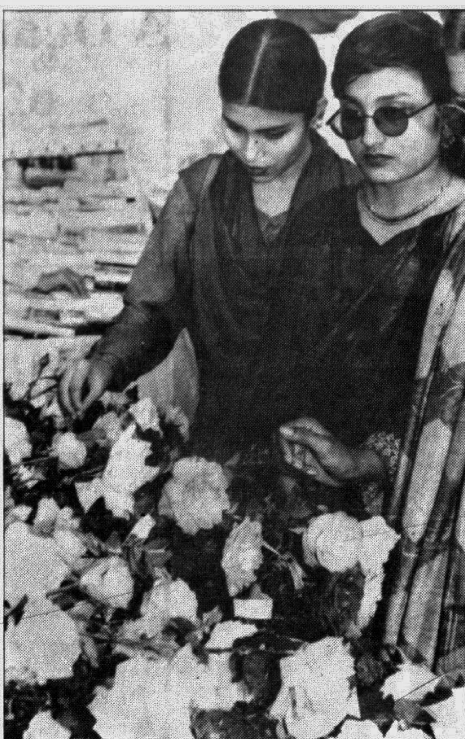
Visitors at the National Flower Exhibition at Sher-e-Bangla Nagar in the city yesterday.

The grant assistance to the grass roots projects started in 1989 under Japanese Grant Assistance Scheme to extend grant to non-governmental organisations, directly.