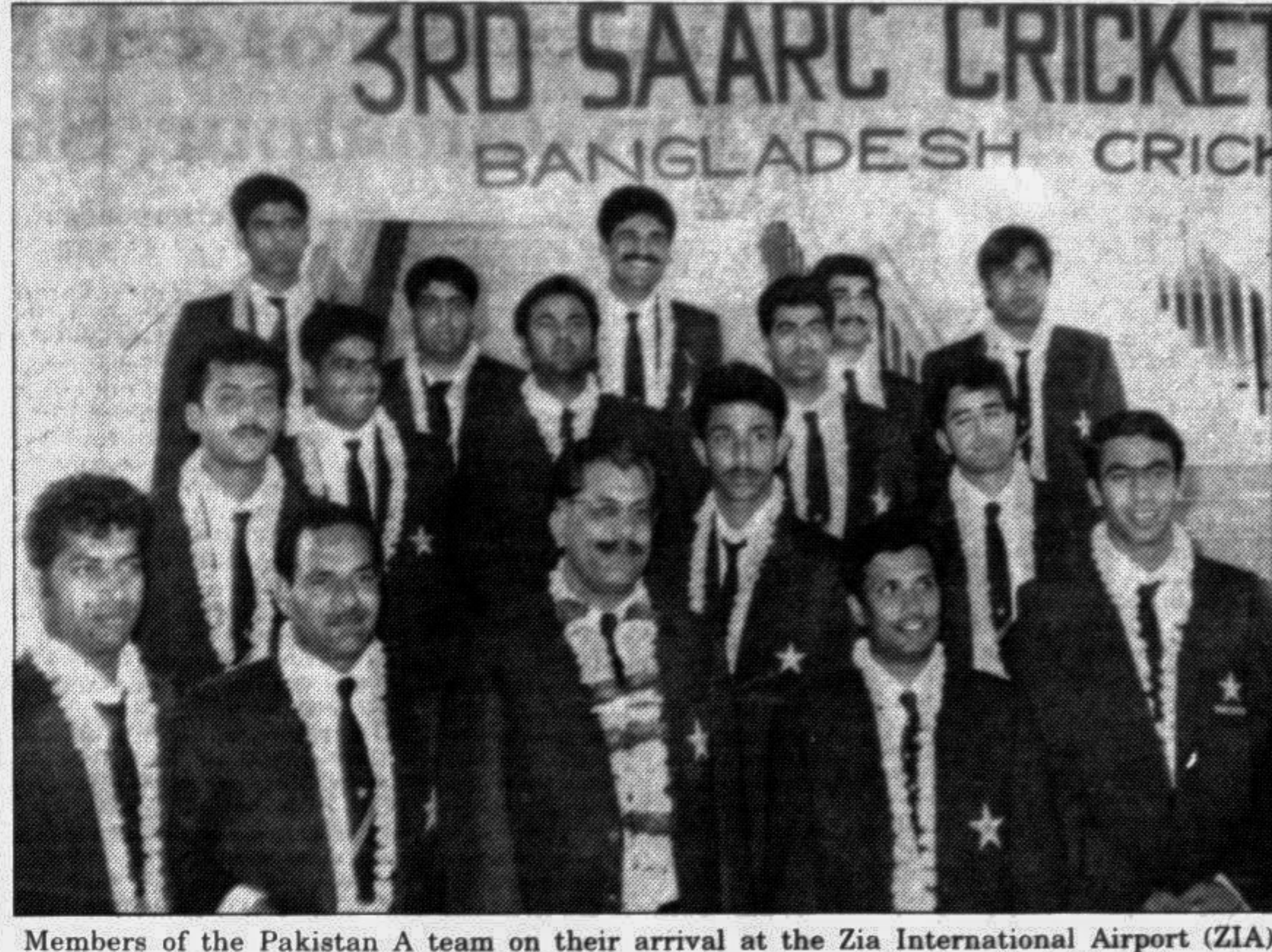
Members of the Pakistan A team on their arrival at the Zia International Airport (ZIA) yesterday. Pakistan A is one of the four teams to take part in the third SAARC cricket tournament, beginning from Wednesday. Hosts Bangladesh, defending champions India A and Sri Lanka A are the other participants in the four-nation regional over-limit cricket competition.

"I've definitely retired from the ATP Tour but I'll still play some exhibitions," said Edberg, ranked No 1 in the world for 72 weeks between 1990-92 and the owner of six Grand Slam titles.