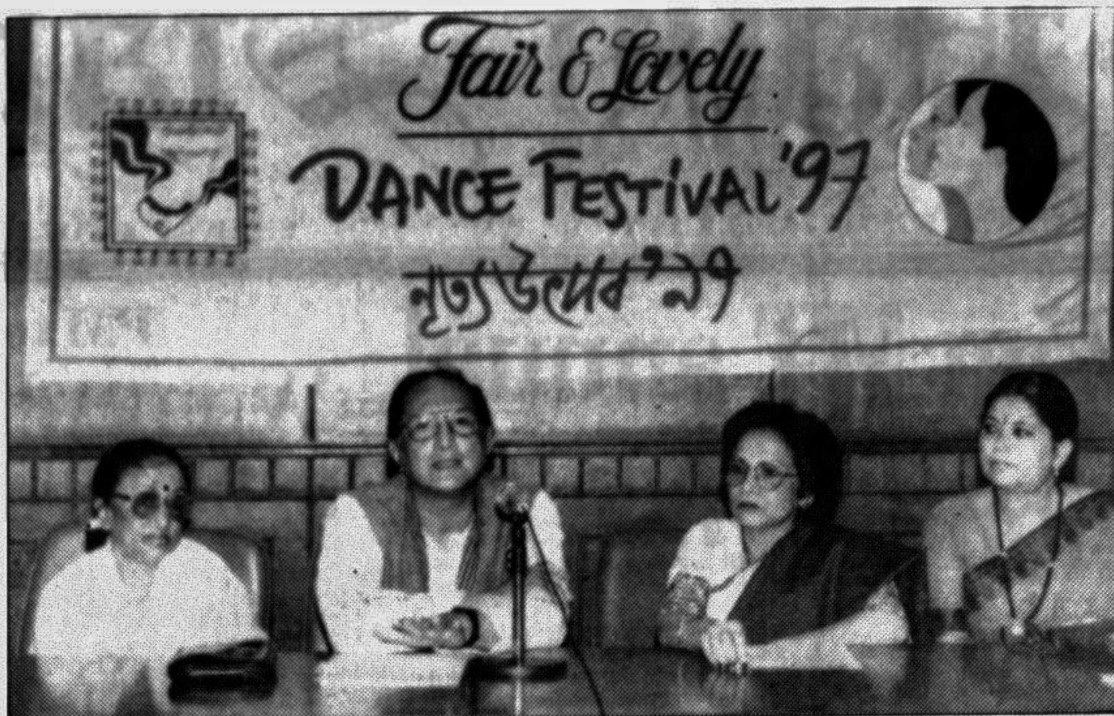
The organisers of Fair and Lovely Dance Festival '97 held a press conference at the Jatiya Press Club yesterday.