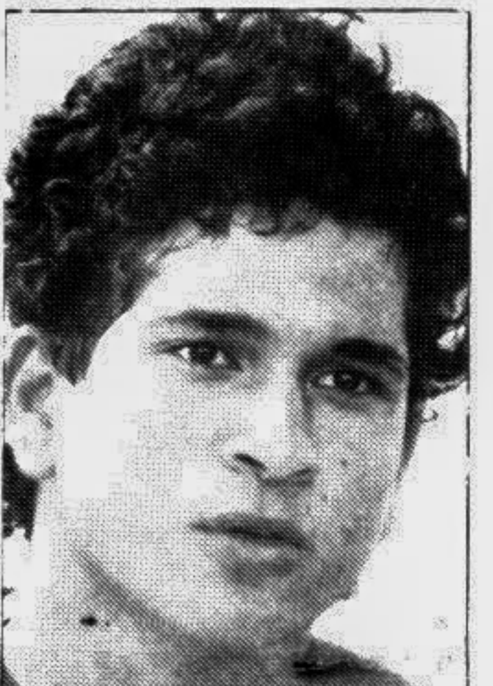
Sachin Tendulkar (India captain) "We have to look for batsmen who would be capable of handling the West Indian attack." Said in South Africa recently.