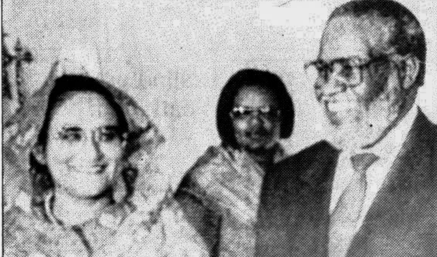
Prime Minister Sheikh Hasina called on Namibian President Sam Nujoma at Rastrapati Bhawan in New Delhi yesterday.

NEW DELHI, Feb 14: The President of India here today launched a global conference on gender equality in politics by calling for an end to bias against women, report agencies. "We must root out prejudice against women and the negative attitude towards their participation in politics," Indian President Shankar Dayal Sharma said, inaugurating the five-day Inter-Parliamentary Union (IPU) summit. "Despite numerous guarantees and safeguards, gender discrimination and prejudice remain a distressing reality," he said. He added: "Clearly we have to do more to promote gender as a central issue in our political advancement... tangible and sustained progress is possible only by focusing on women and the girl-child who remain among the most vulnerable, weak and deprived sections of society."