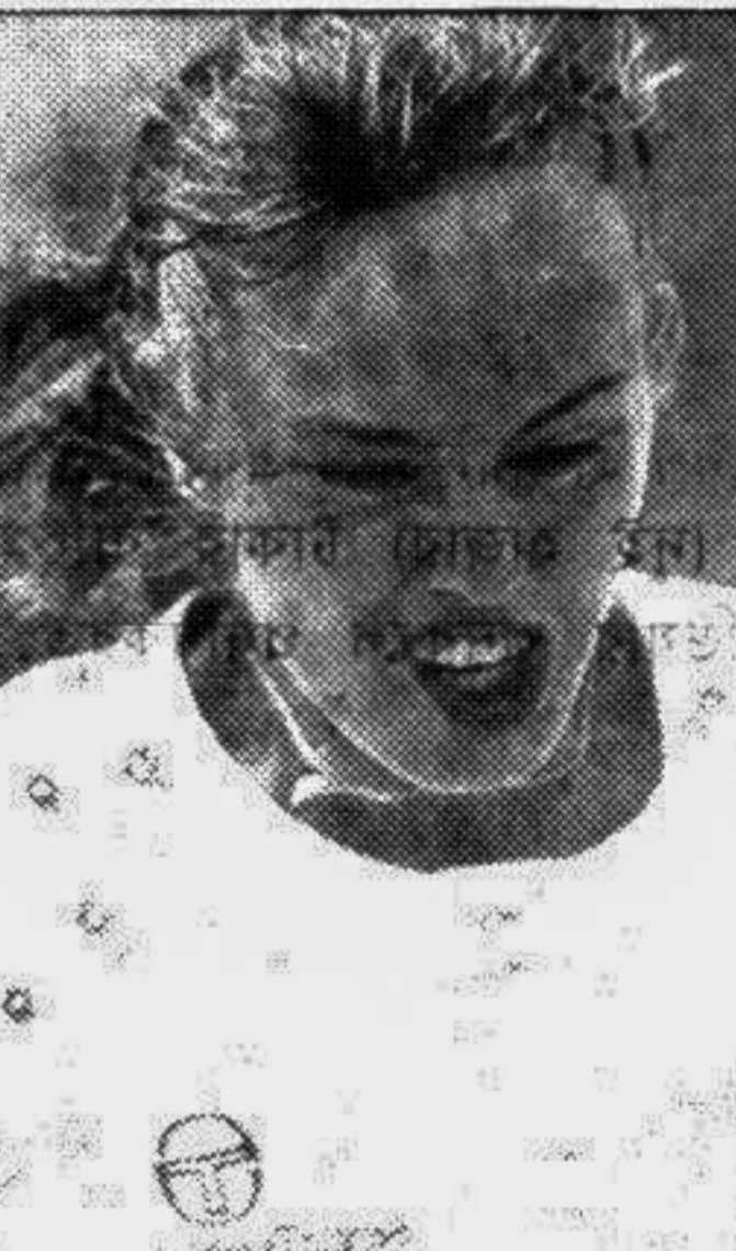
Martina Hingis (Swiss tennis player) "I am playing with a new racket. I feel my game has become faster and more powerful."