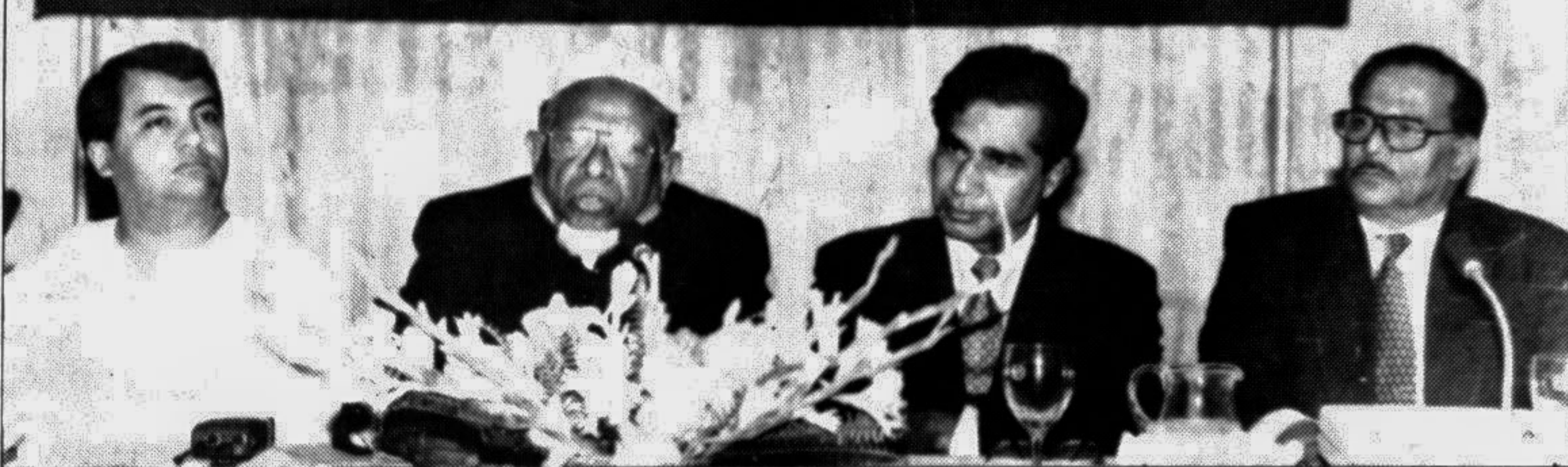
Chief patron of the third SAARC cricket tournament organising committee Foreign Minister Abdus Samad Azad (second from left) addressing newsmen at a local hotel yesterday in connection with the quadrangular tourney that will get underway in the capital from February 19. BCB president Saber Hossain Chowdhury, MP (L) is also seen.