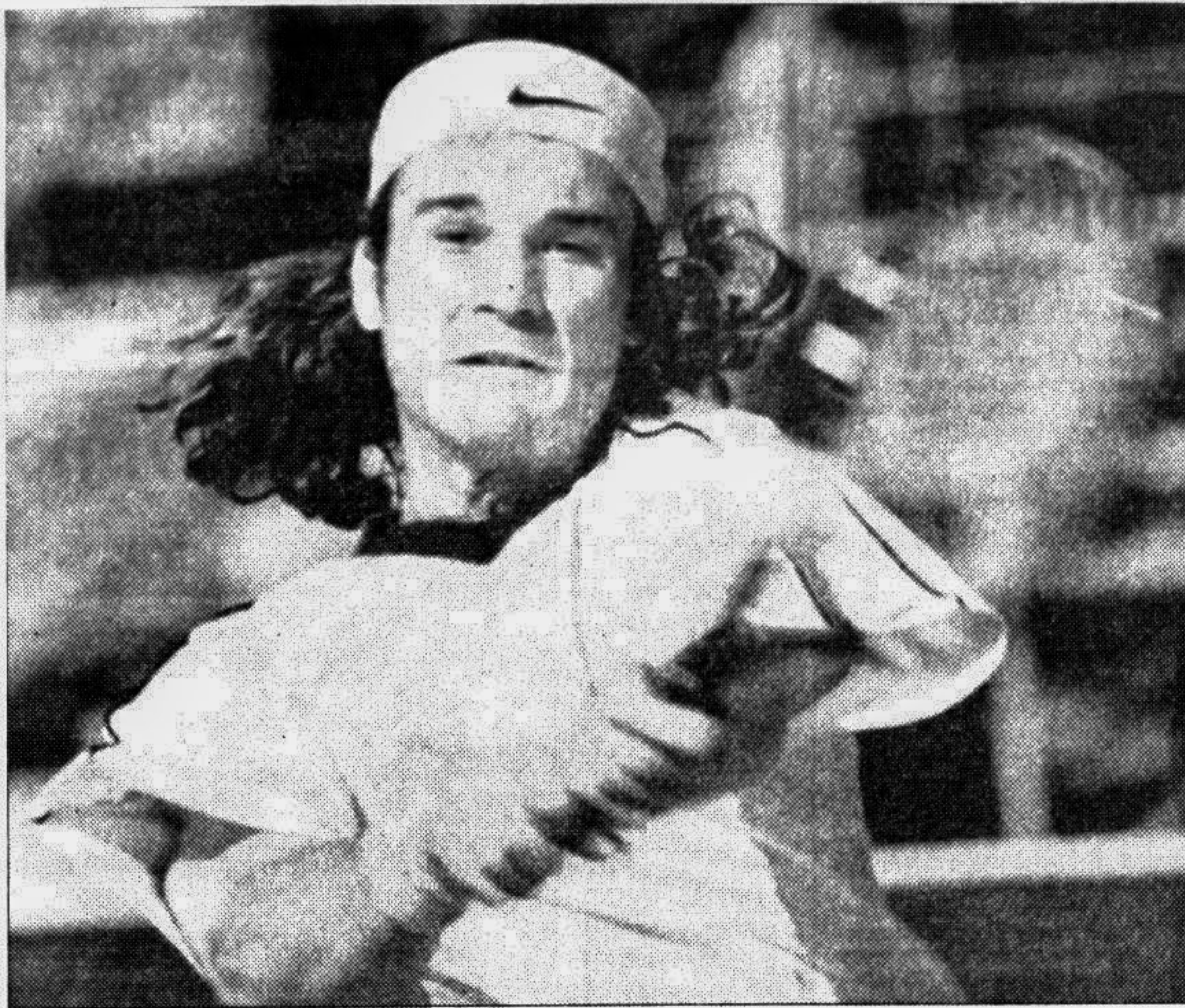
Spaniard Carlos Moya makes a backhand return against Marc-Kevin Goellner of Germany during their Davis Cup first round engagement in Spain on Feb 7. Moya won 6-4, 6-3 and 6-3.