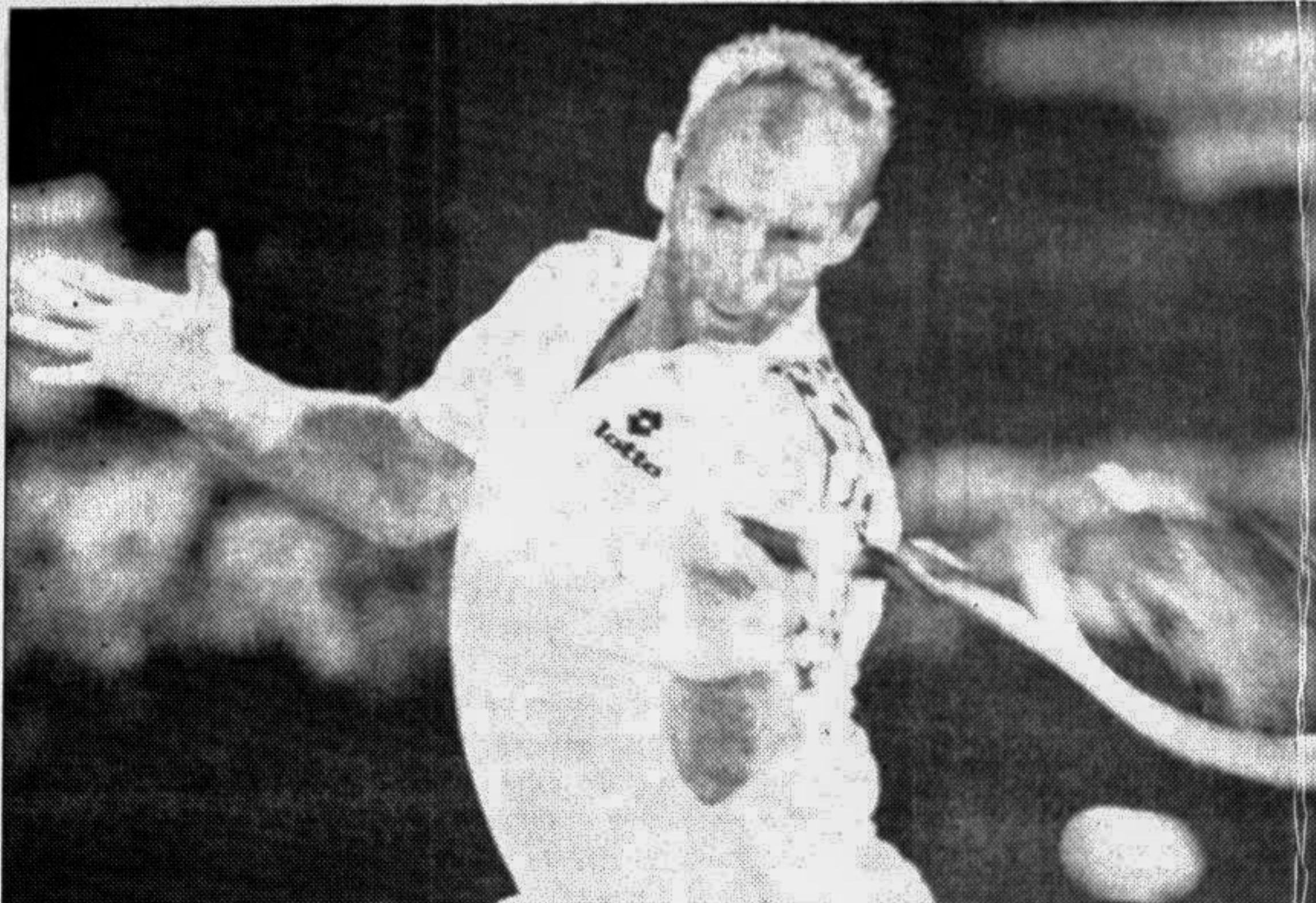
Austrian Thomas Muster plays a forehand return against Tomas Nydahl during the second round match of the Dubai Open in UAE on Feb 11. Muster won 6-4, 6-3.