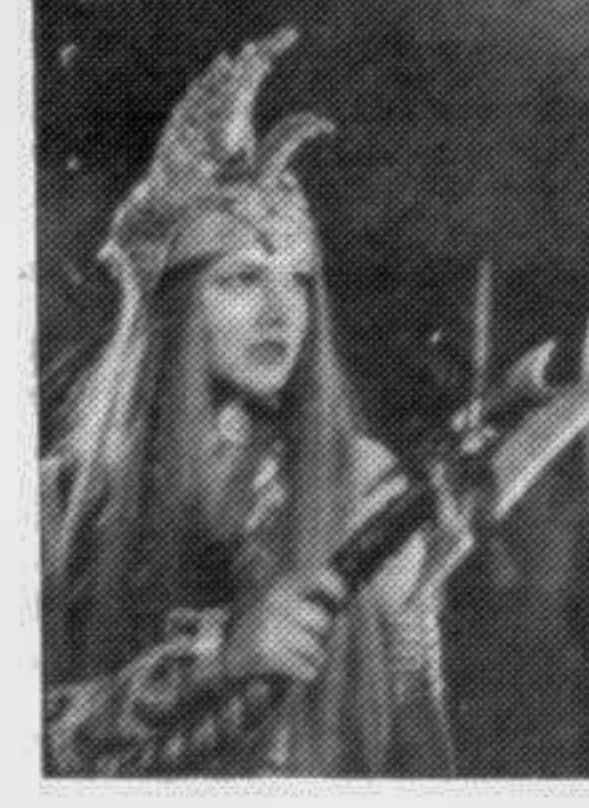
Arabian Nights on BTV, Tonight at 8:30