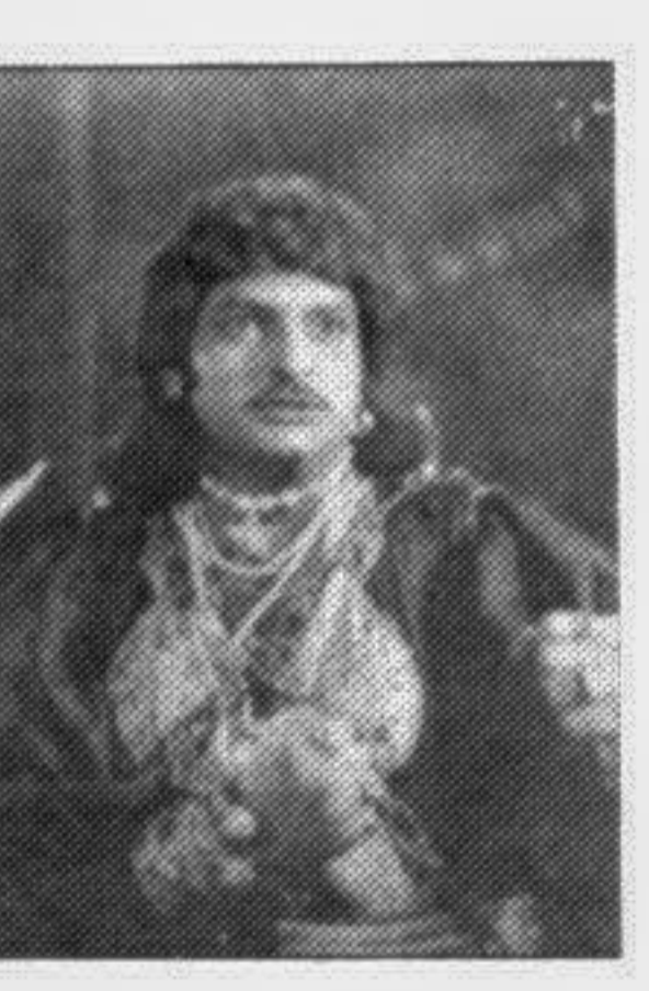
Arabian Nights on BTV, Tonight at 8:30

1:00 By Demand VJ Trey 2:00 Frame by Frame 2:30 First Day Planet Show 3:00 BPL Oye 4:00 Planet Ruby 4:30 Big Bang VJ Alessandria