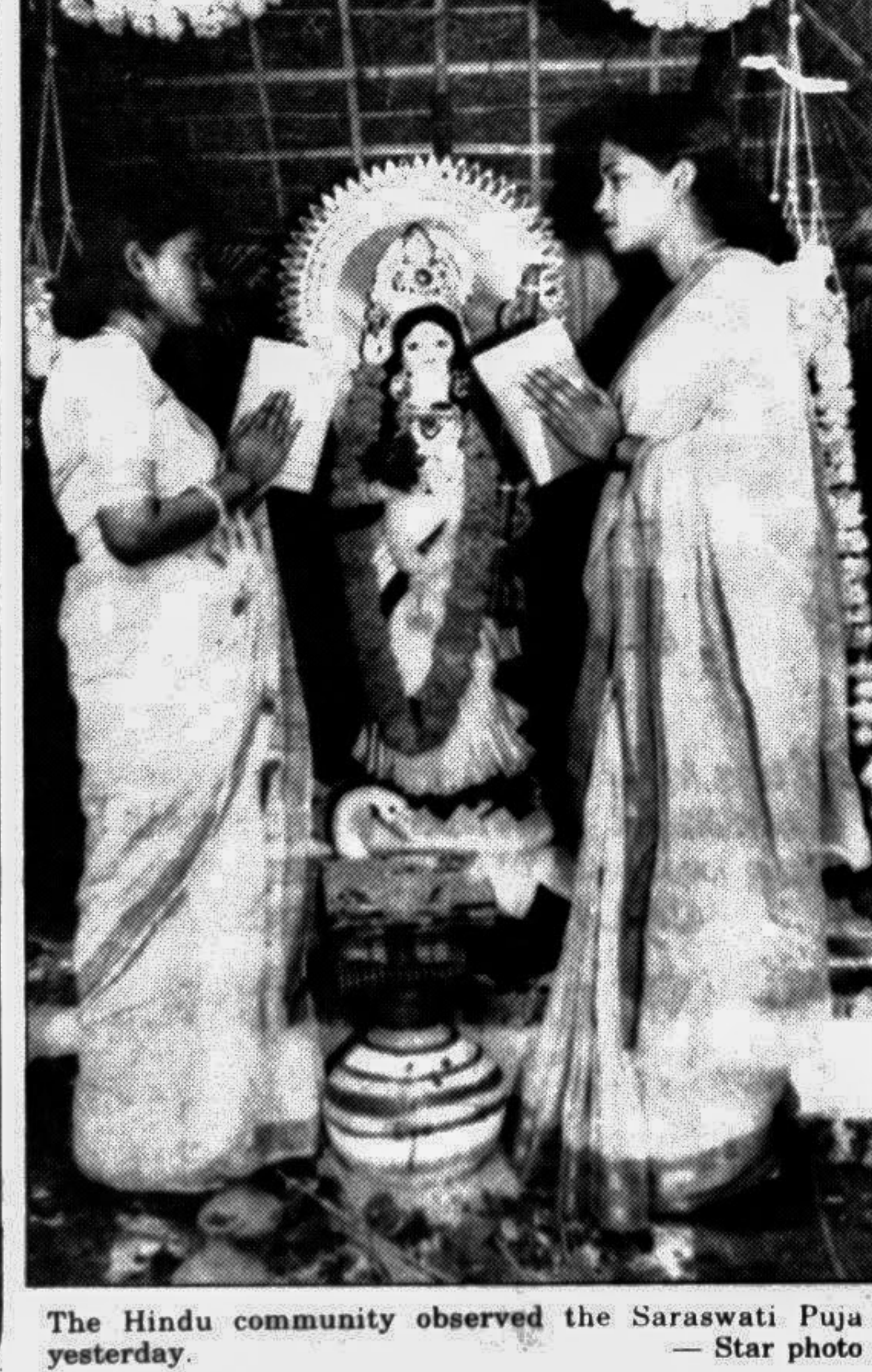
The Hindu community observed the Saraswati Puja yesterday.