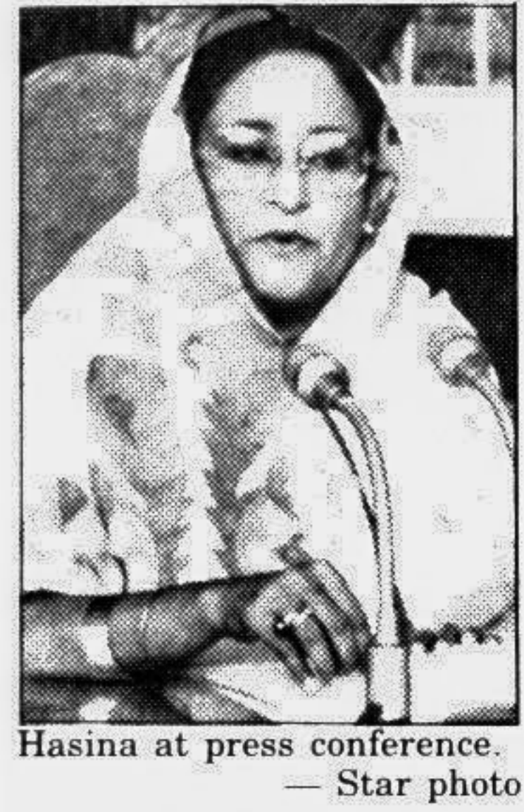
Hasina at press conference.

By Staff Correspondent Prime Minister Sheikh Hasina has said she does not see any prospect for the Opposition to destabilise the political situation through anti-government agitation in the near future. "I don't think they can create such an atmosphere because the people, who have shed much blood for democracy, are now very conscious and they won't tolerate playing with their franchise," she told a press conference at the Ganabhaban, her official residence, yesterday afternoon. The main opposition BNP said earlier that it would launch a tough anti-government agitation programme 15 days after the Eid-ul-Fitr if its demands including an end to alleged repression on the Opposition activists were not fulfilled. Replying to a question, the Prime Minister further said, "At best the opposition party can damage vehicles in the name of agitation. But no agitation can succeed without the participation of the people who now want peace and stability which is a must for foreign investment." Sheikh Hasina, however, hastened to add, "The rulers in the past 21 years had placed their people at different positions (in the administration) who are now trying by different means to thwart our endeavours and initiatives. I would like to leave to the people to decide if they (the Opposition) have any right to stop our march towards progress and prosperity." The press conference was arranged to brief the newsmen on the outcome of her visit to the