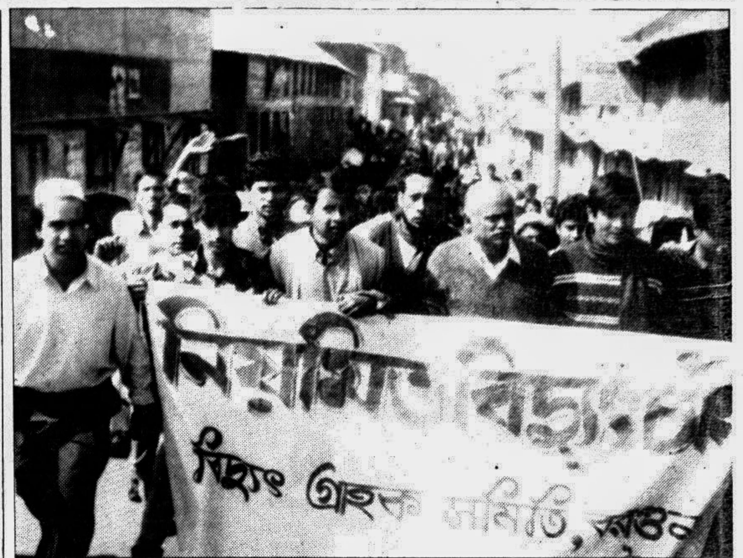
Agitated electricity consumers recently brought out a rally demanding regular supply of electricity in Barguna. They later gheraoed the local Power Development Board office in the town to press home their demand.

He urged the concerned authorities to take all possible measures to bring the fallow land under cultivation without further delay.